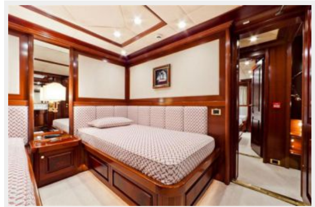
Guest twin stateroom 1