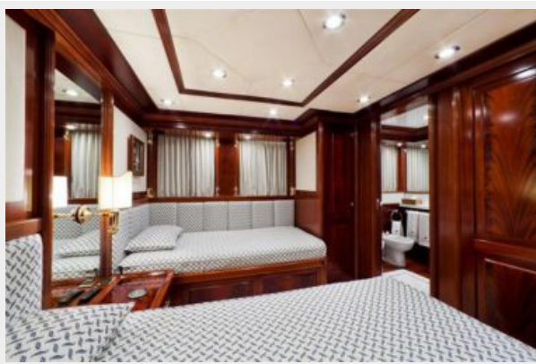
Guest twin stateroom