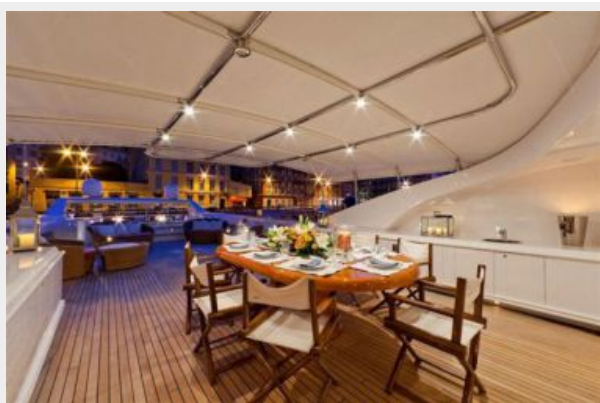
Dining area on sundeck