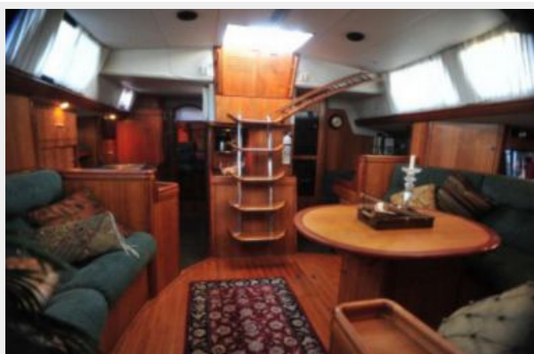
Salon Looking Aft to Starboard Side