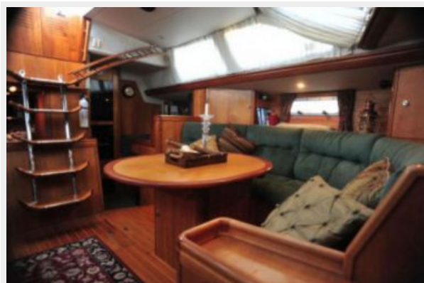
Salon looking aft to Port Side