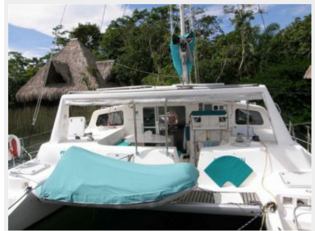
COCKPIT AND DINGHY