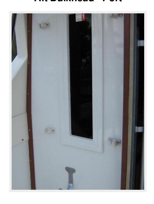
Aft Bulkhead - Port