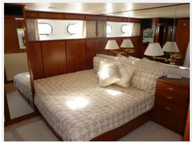
Guest King Stateroom