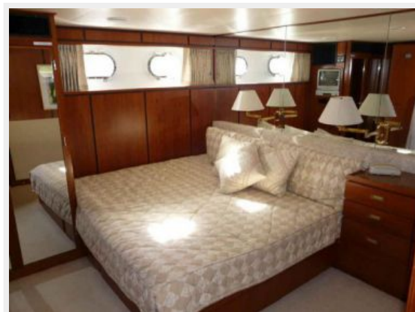
Guest King Stateroom