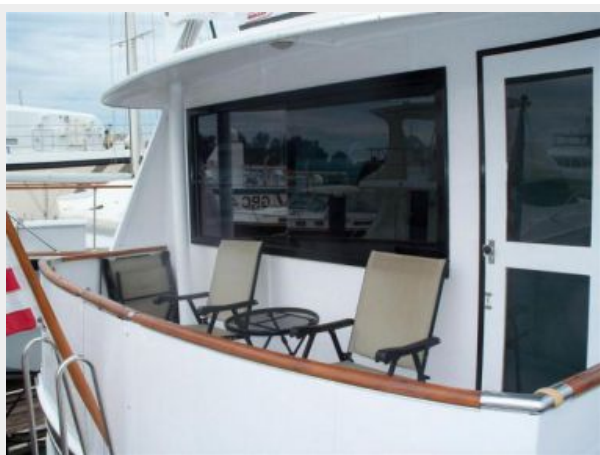
Aft deck custom enclosure w/line handling area