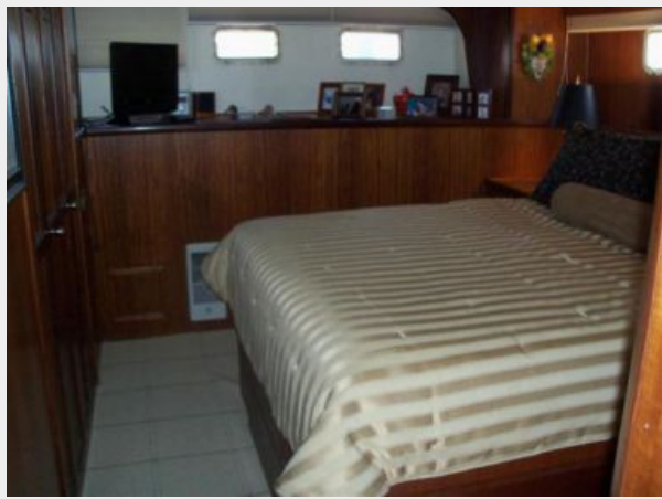
Master Stateroom w/Custom Bedding