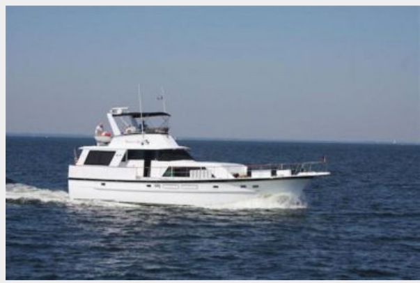
Underway w/Custom Pilot House Door Open