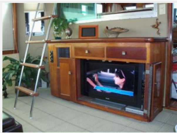
Custom TV Capinet