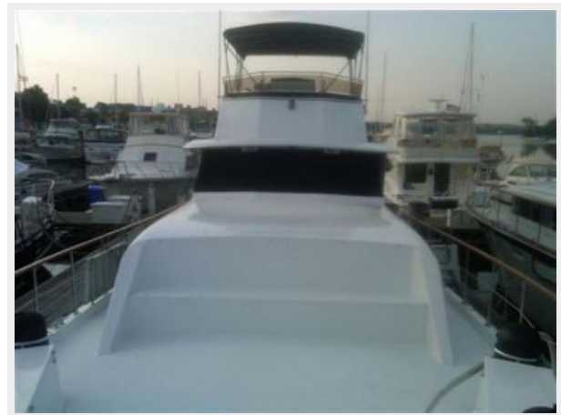
Looking Aft from the bow