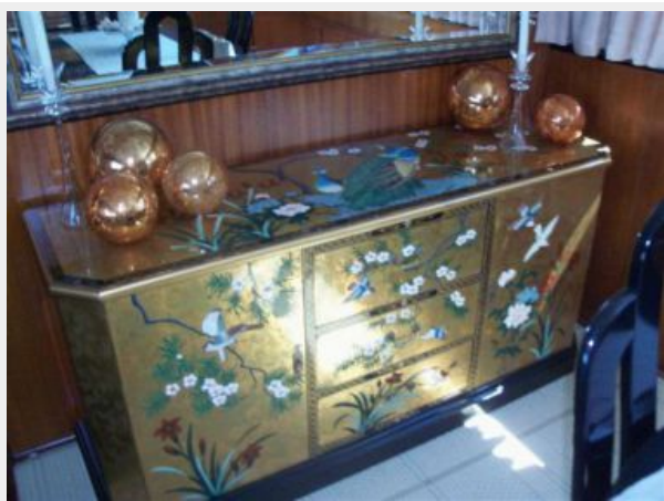
Hand painted Chinese Chest for storage