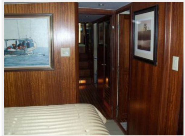
Master Stateroom looking fwd