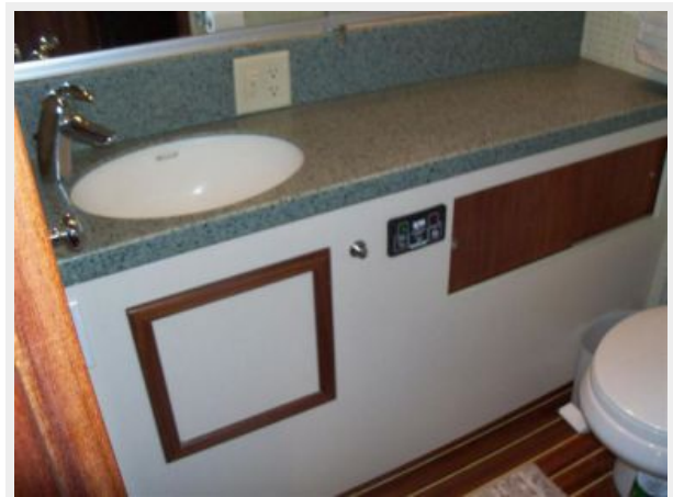
Master SR Head/Shower (All heads done similar)