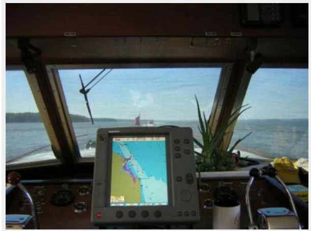
Pilot House with Raymarine RL80CRC