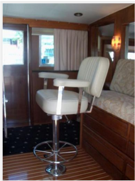
Pilothouse Helm Chair & Sofa Seating