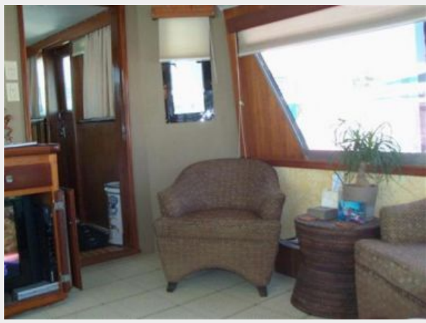
Upper Salon looking forward