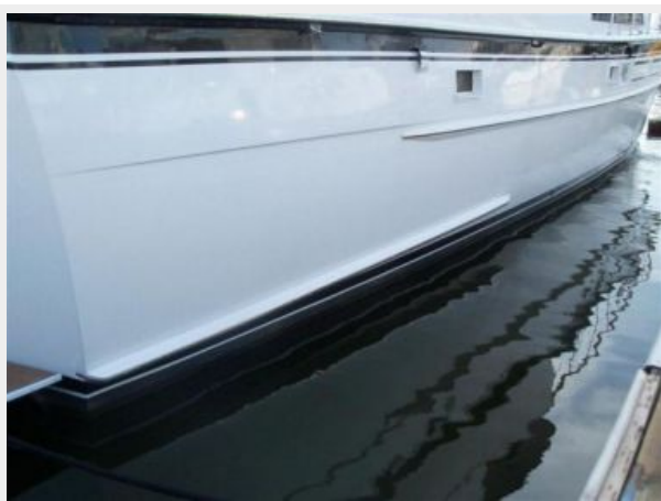
Stbd Hull - Waterline