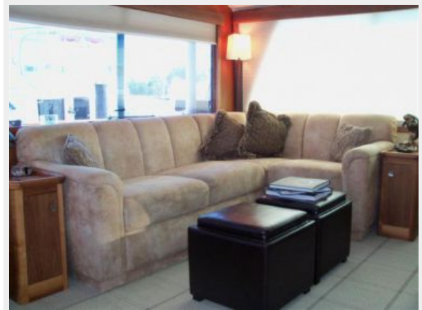
Custom full sized "L" sofa & endtables w/storage