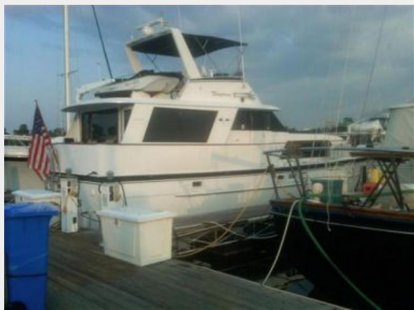
Starboard Profile w/Custom Arch & 11 ft Whaler