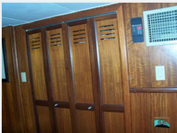
Master Stateroom Large Hanging Closet