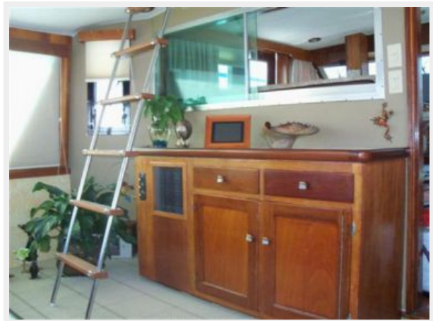
Custom TV & A/C Cabinet w/granite counter