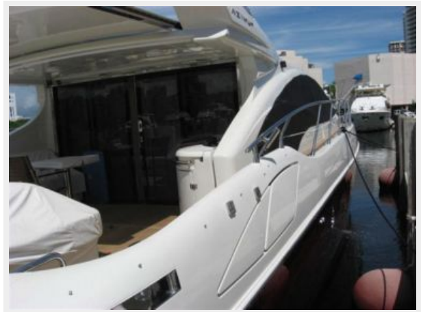
Strbrd from Aft