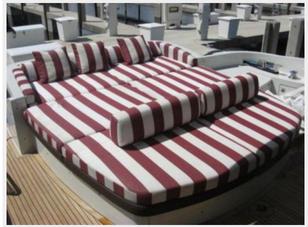
Cockpit Table / Seating