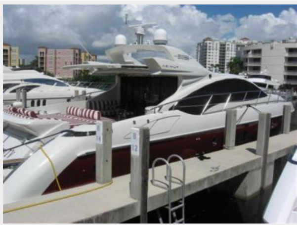
Strbrd from Aft