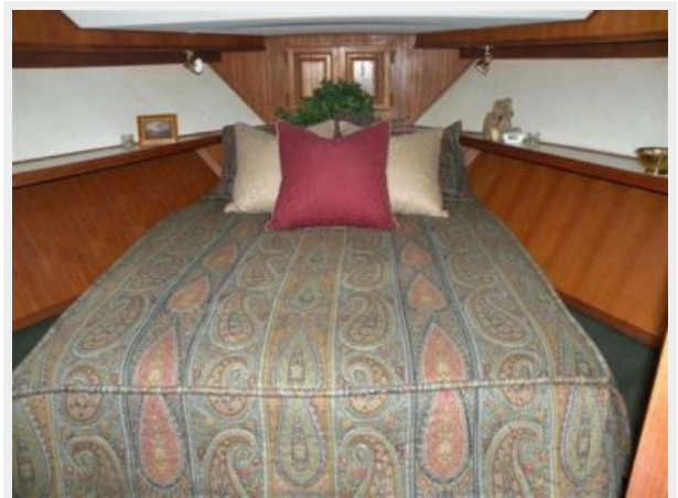
Master Forward berth