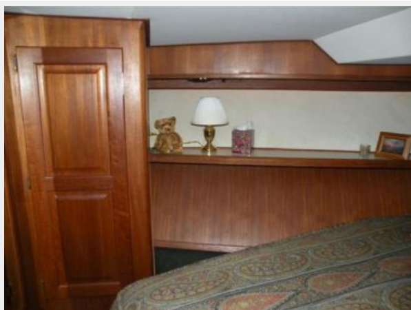
Port Side view in Master