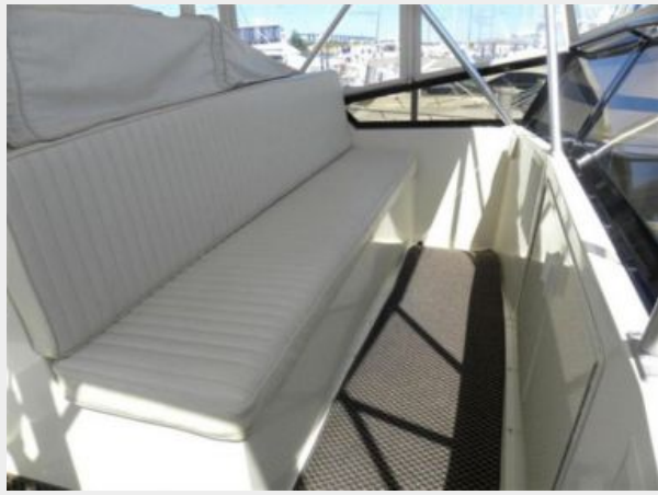
Front Facing Guest Seating Bridge