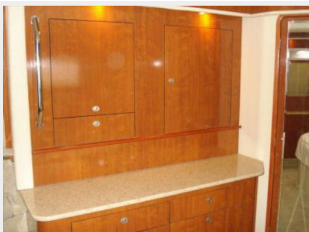
Entertainment System closed