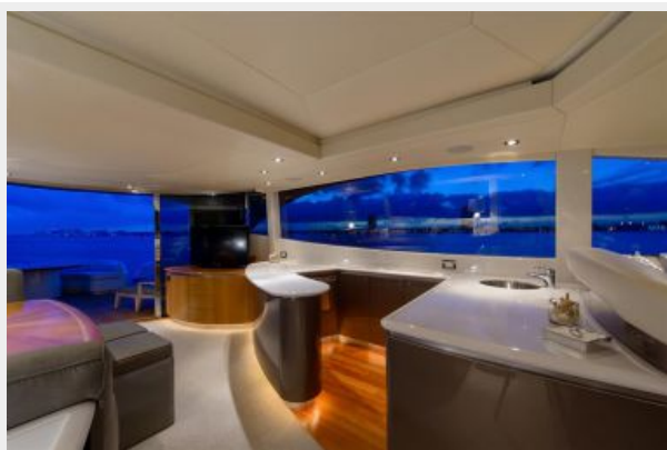
Upper Deck Dinette