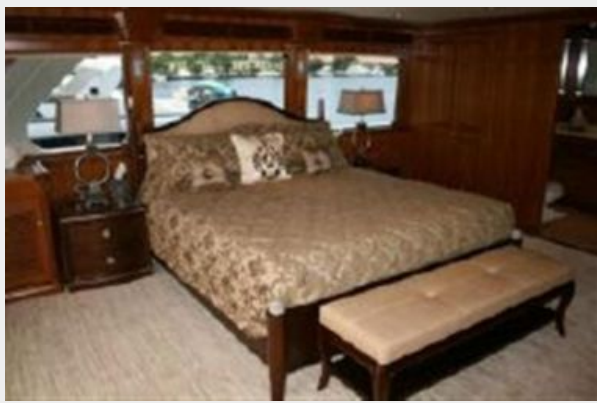
VIP Skylounge Stateroom