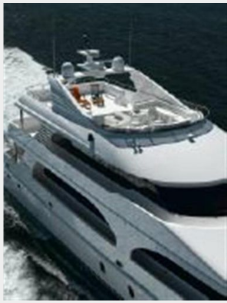
Top Deck Profile