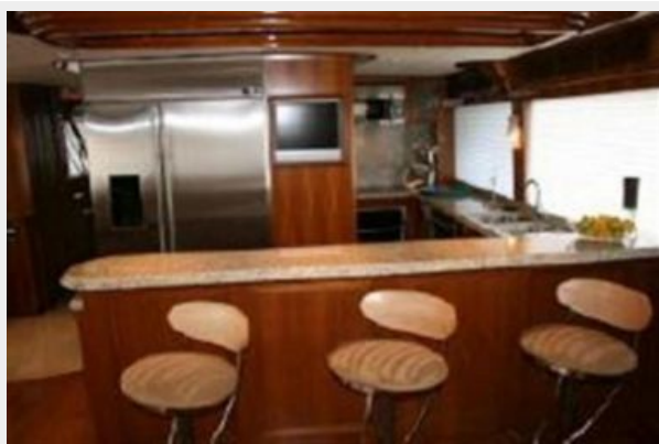
Galley Aft View