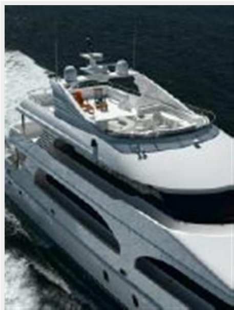
Top Deck Profile