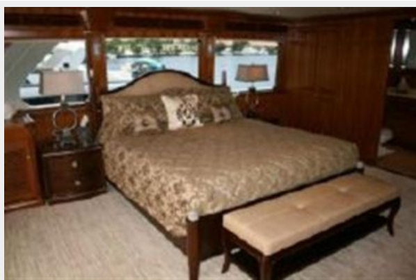
VIP Skylounge Stateroom