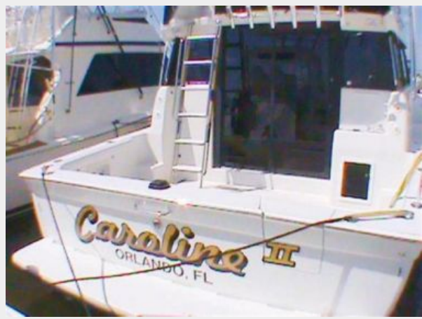
Sliding Entry Door