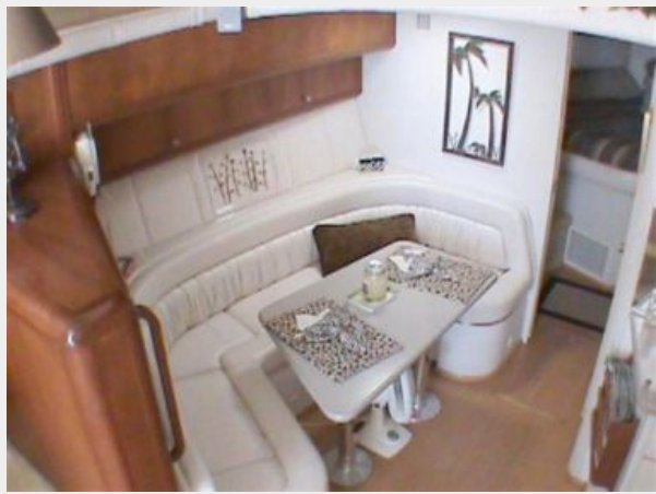
Dinette View 1