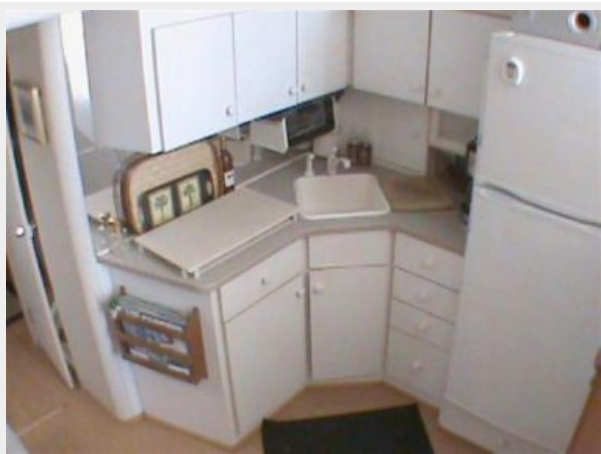
Galley View 1