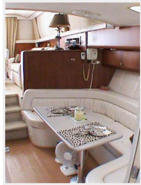
Dinette View 2