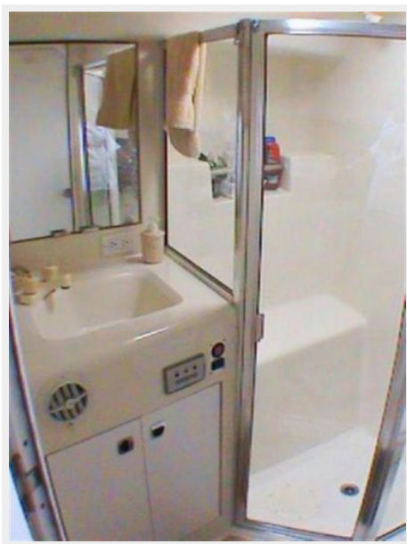
Head and Shower View 1