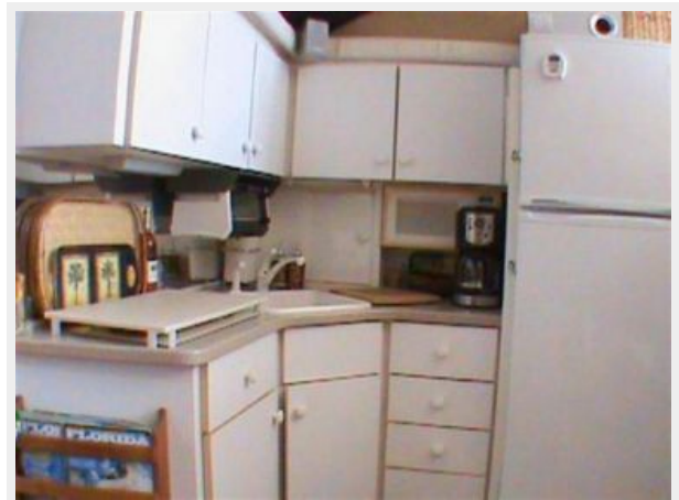
Galley View 2