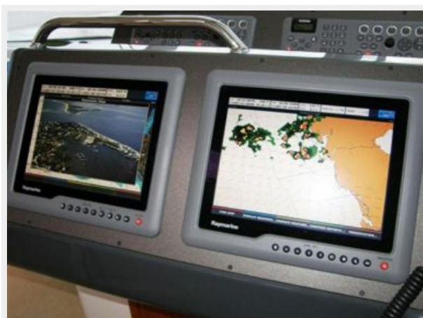
G Series RayMarine