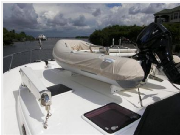
Dinghy & Davit