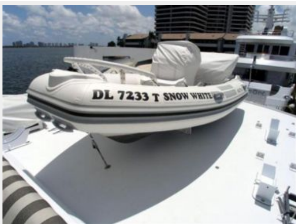
Nautica Rib Tender