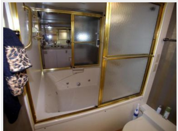
Master Jacuzzi Tub with Shower