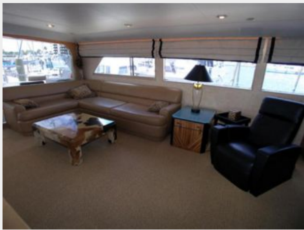
Salon to Port