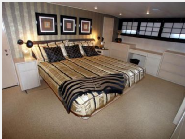
Master Stateroom to Port