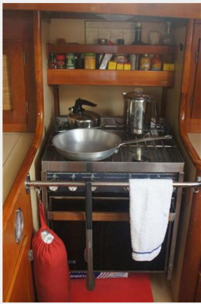
Force 10 Range with Oven/Broiler