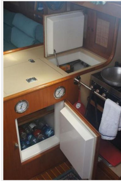
Refrigerator / Freezer