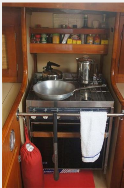
Force 10 Range with Oven/Broiler