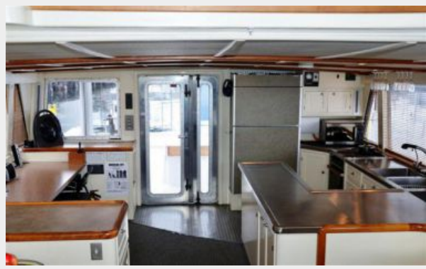
Main Cabin Aft