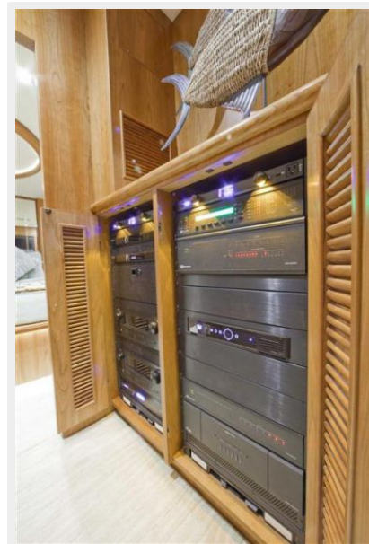
Salon Entertainment System