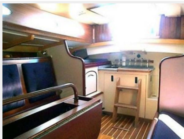
Interior, Starboard Aft Corner