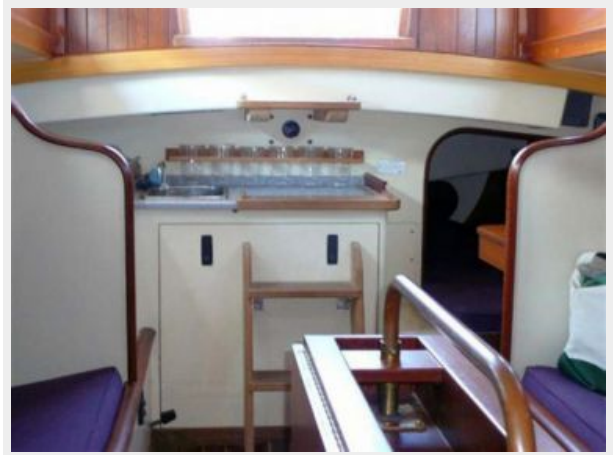
Interior, Facing Aft