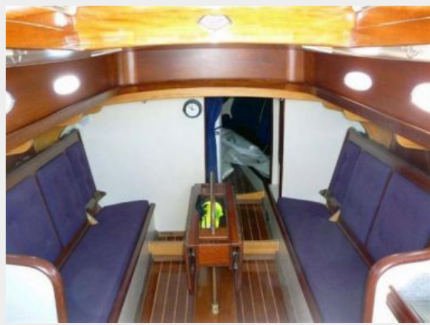
Interior, Facing Forward