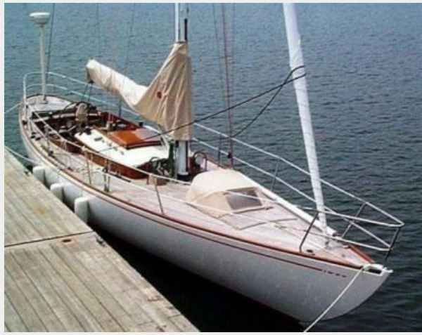
From Starboard Bow, at the Dock