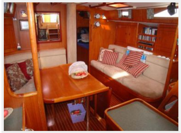
Main Salon Looking Forward