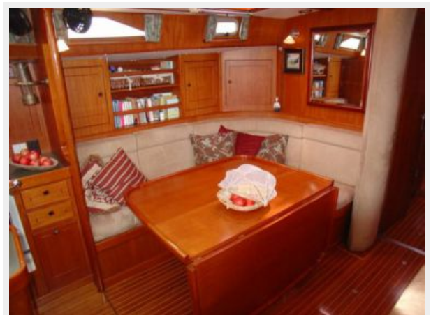
Main Salon Port Side