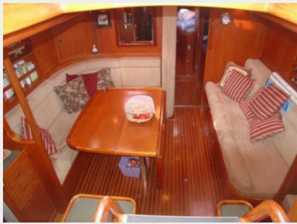
Main Salon from Companionway