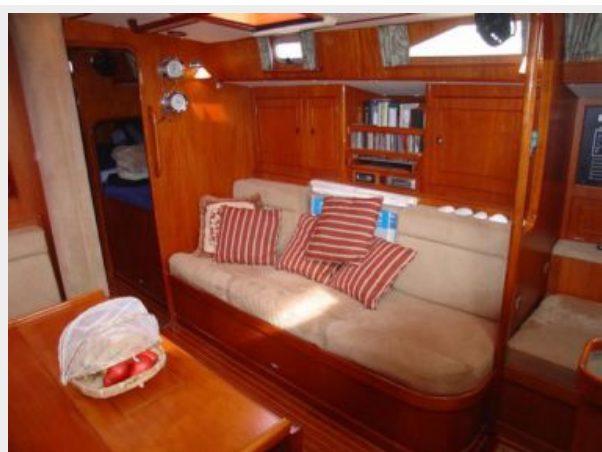
Main Salon Starboard Side