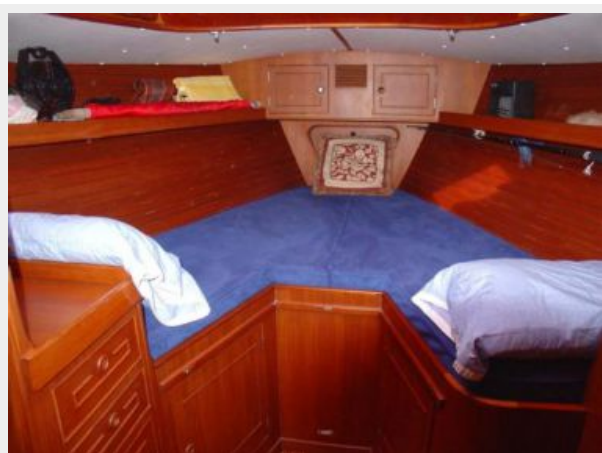
Forward Guest Stateroom