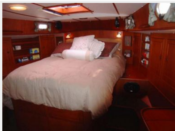
Owner's Stateroom, Centerline Queen Berth