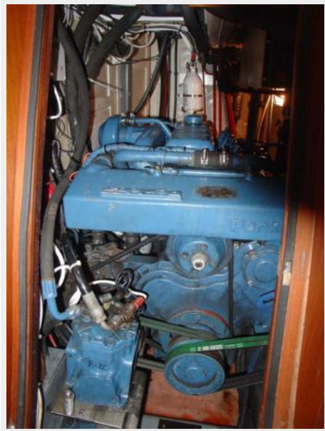
Engine Room, Forward