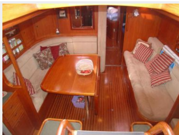
Main Salon from Companionway