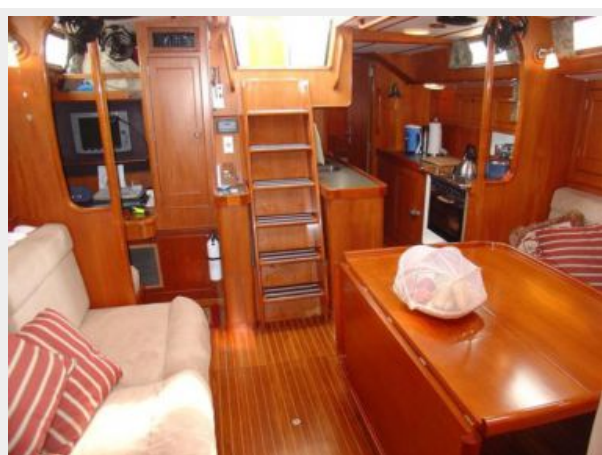
Main Salon Looking Aft