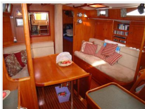
Main Salon Looking Forward