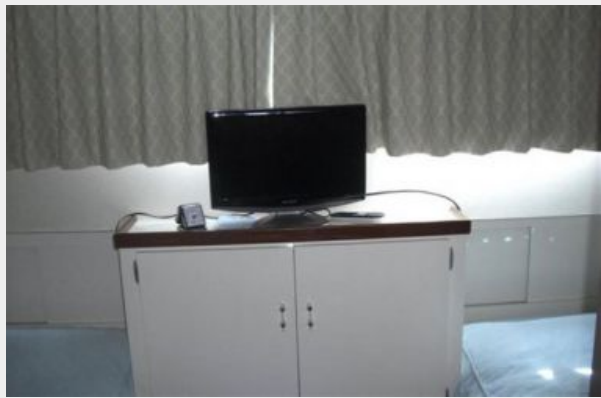
70' Hatteras Motoryacht port forward stateroom