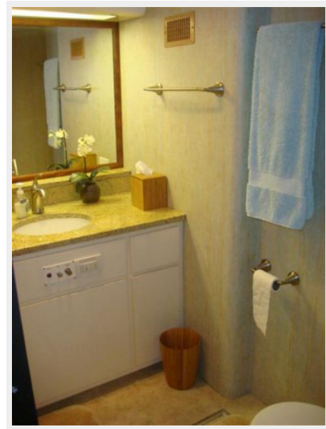
70' Hatteras Motoryacht master stateroom head