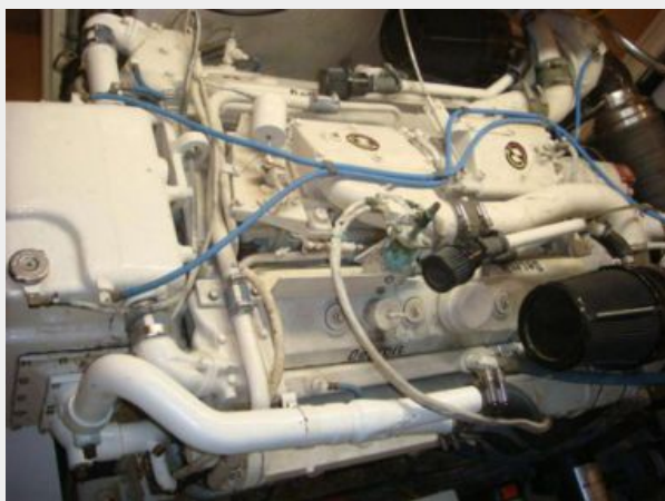
70' Hatteras Motoryacht starboard main engine