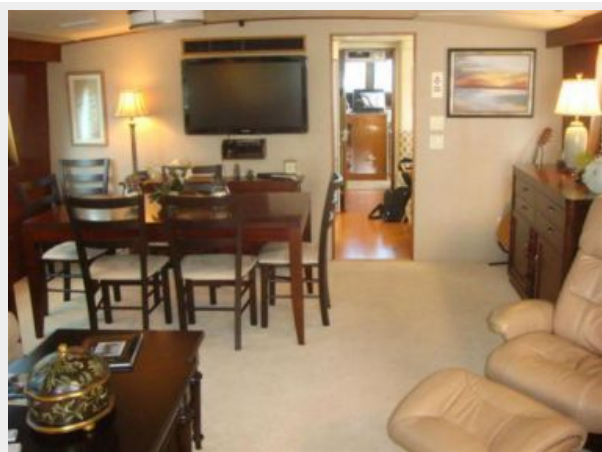
70' Hatteras Motoryacht salon forward