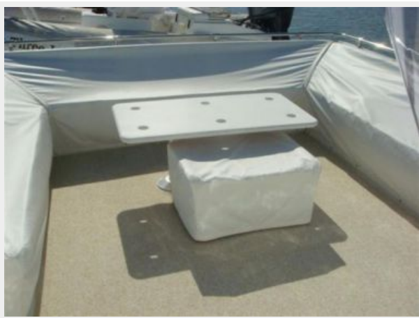
70' Hatteras Motoryacht flybridge aft seating covered