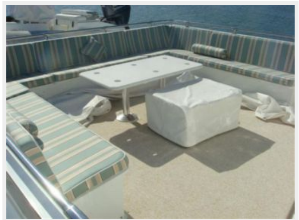
70' Hatteras Motoryacht flybridge aft seating uncovered