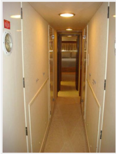
70' Hatteras Motoryacht guest companionway