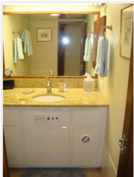
70' Hatteras Motoryacht starboard aft guest head