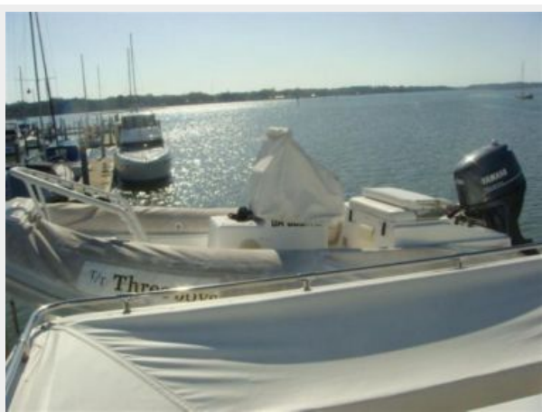
70' Hatteras Motoryacht tender