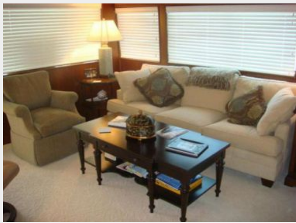
70' Hatteras Motoryacht salon port seating