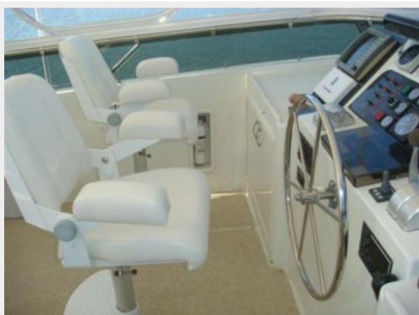
70' Hatteras Motoryacht flybridge port