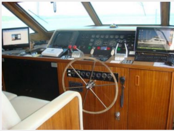
70' Hatteras Motoryacht pilothouse forward