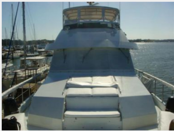
70' Hatteras Motoryacht foredeck aft