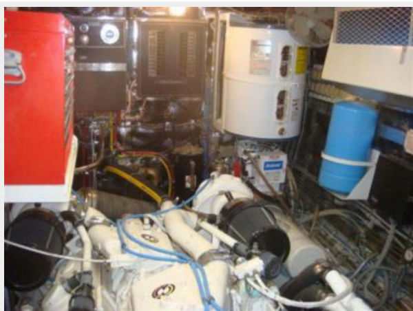
70' Hatteras Motoryacht port engine room aft