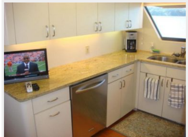
70' Hatteras Motoryacht galley3