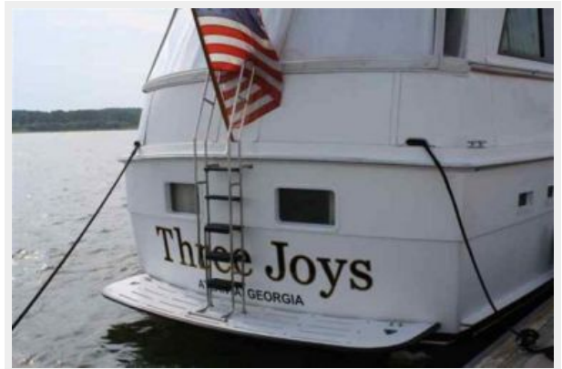
70' Hatteras Motoryacht swimplatform