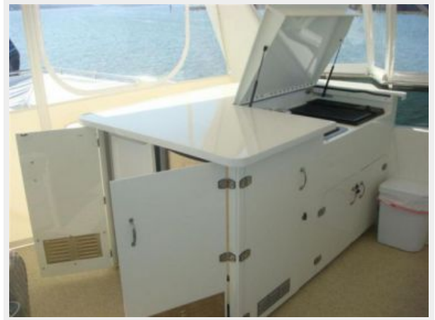
70' Hatteras Motoryacht flybridge bar2