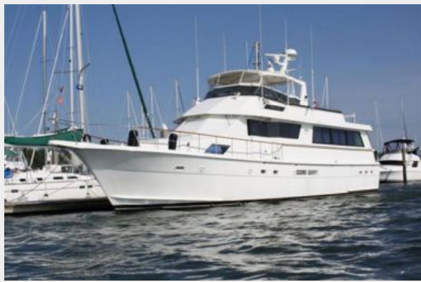
70' Hatteras Motoryacht port forward profile