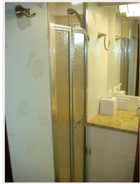
70' Hatteras Motoryacht starboard forward guest head