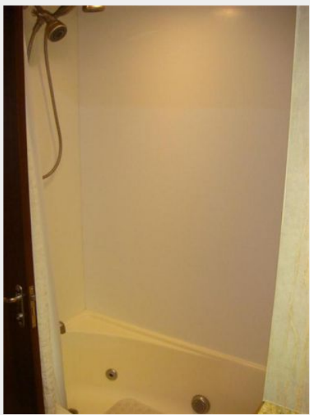
70' Hatteras Motoryacht master stateroom shower-tub