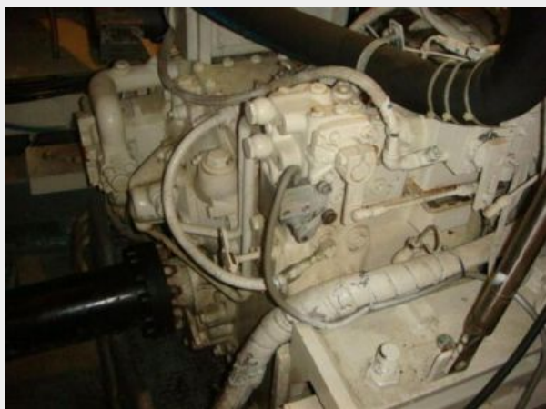
70' Hatteras Motoryacht port gearbox