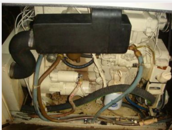
70' Hatteras Motoryacht generator1