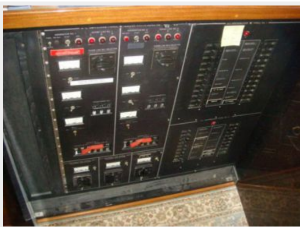
70' Hatteras Motoryacht electrical panel2