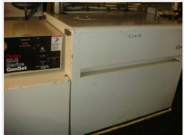
70' Hatteras Motoryacht generator1 soundbox