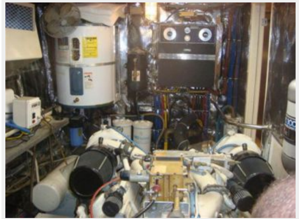
70' Hatteras Motoryacht starboard engine room aft