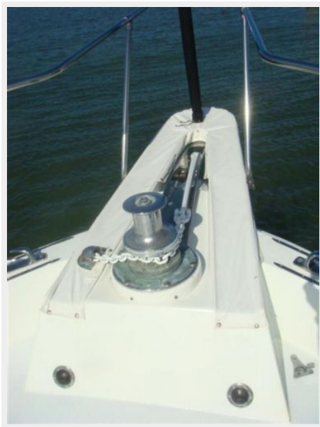
70' Hatteras Motoryacht anchor windlass