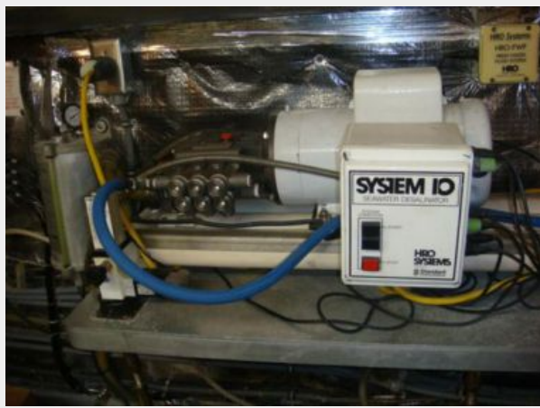
70' Hatteras Motoryacht watermaker