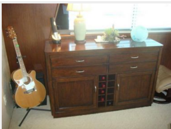
70' Hatteras Motoryacht salon starboard forward