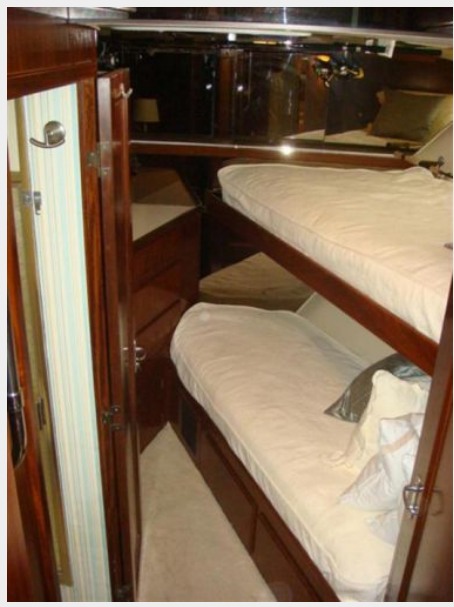
70' Hatteras Motoryacht forward guest stateroom