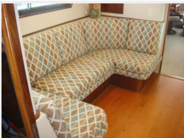
70' Hatteras Motoryacht galley settee1