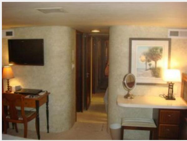
70' Hatteras Motoryacht master stateroom forward