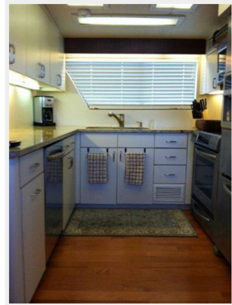
70' Hatteras Motoryacht galley1