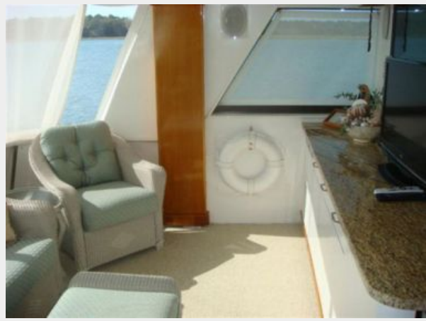
70' Hatteras Motoryacht aftdeck port