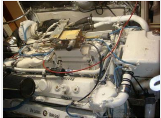
70' Hatteras Motoryacht port main engine