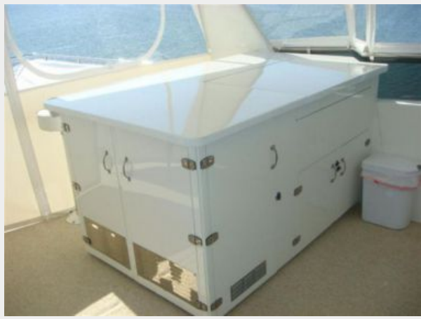
70' Hatteras Motoryacht flybridge bar1