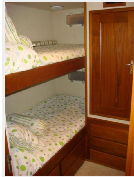
70' Hatteras Motoryacht port aft guest stateroom