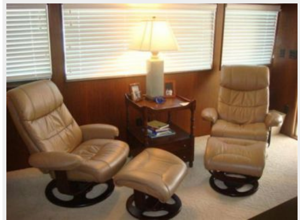
70' Hatteras Motoryacht salon starboard seating