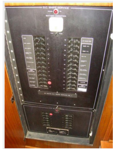
70' Hatteras Motoryacht electrical panel1