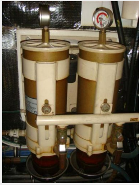
70' Hatteras Motoryacht Racor fuel filters