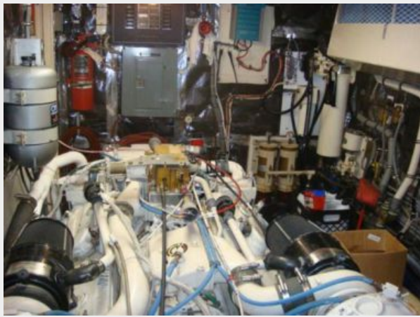
70' Hatteras Motoryacht starboard engine room forward