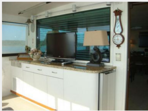
70' Hatteras Motoryacht aftdeck forward