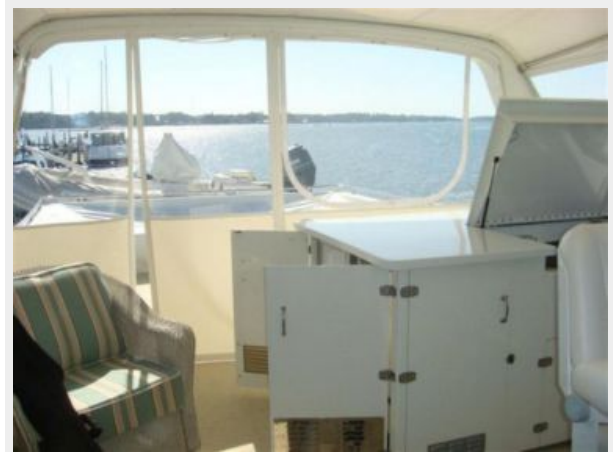
70' Hatteras Motoryacht flybridge aft