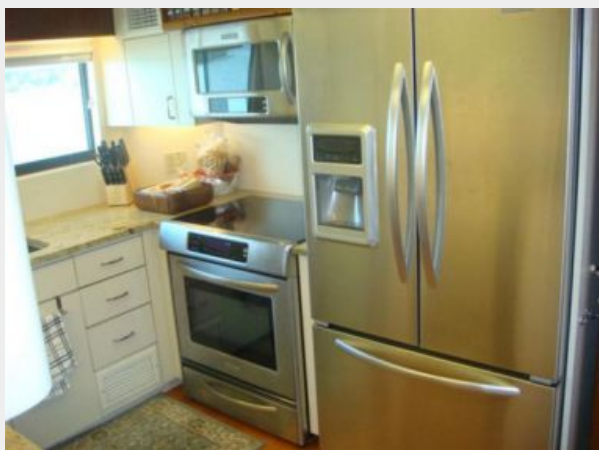
70' Hatteras Motoryacht galley2