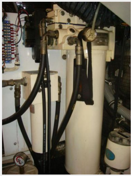
70' Hatteras Motoryacht Naiad stabilizer hydraulic pak