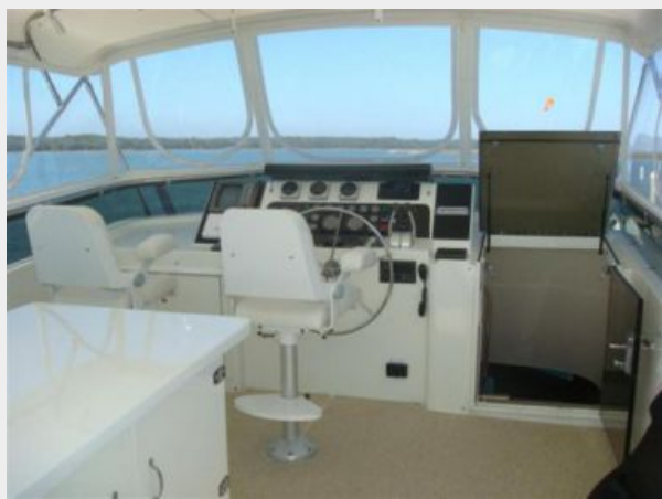
70' Hatteras Motoryacht flybridge forward