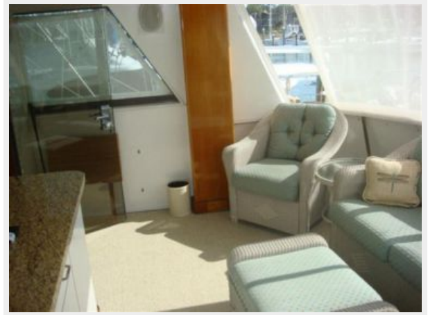
70' Hatteras Motoryacht aftdeck starboard