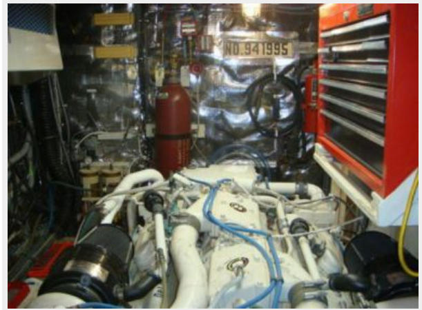
70' Hatteras Motoryacht port engine room forward