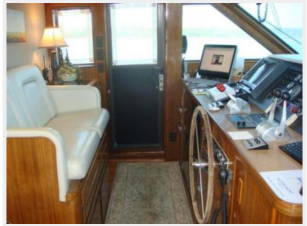
70' Hatteras Motoryacht pilothouse port