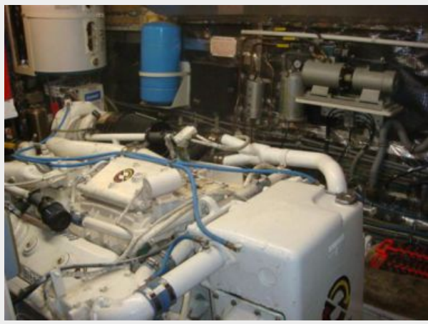
70' Hatteras Motoryacht port engine room