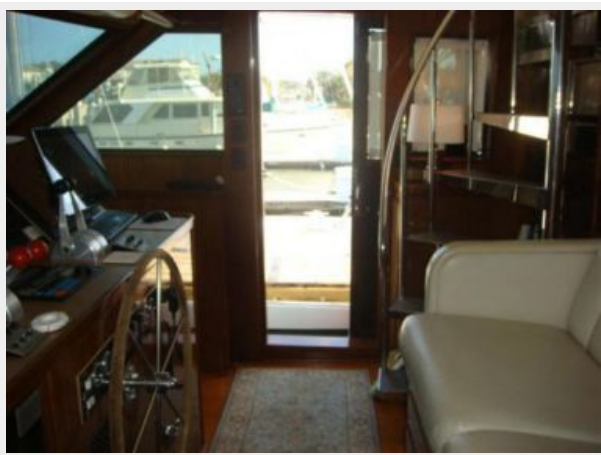
70' Hatteras Motoryacht pilothouse starboard