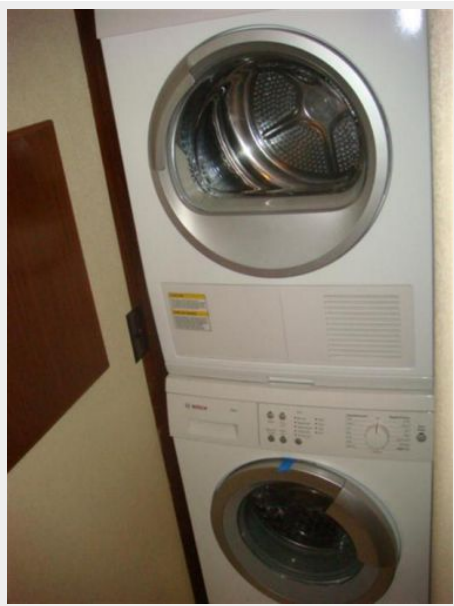
70' Hatteras Motoryacht washer-dryer