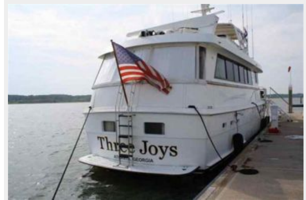
70' Hatteras Motoryacht aft profile