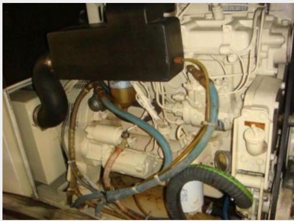
70' Hatteras Motoryacht generator2