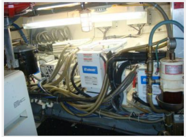
70' Hatteras Motoryacht air conditioning compressors