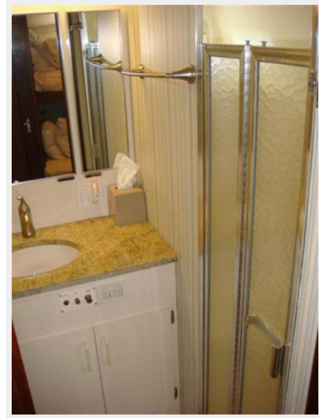
70' Hatteras Motoryacht forward guest stateroom head