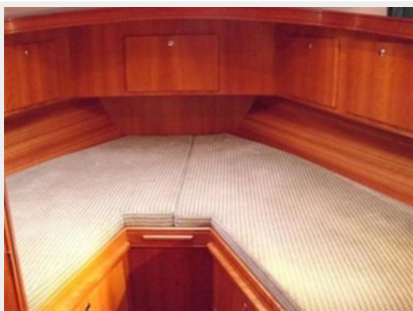
Guest Stateroom V-Berth