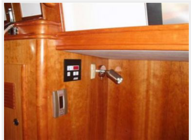
Master Stateroom AC control