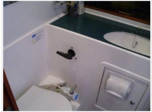
Master Stateroom Head