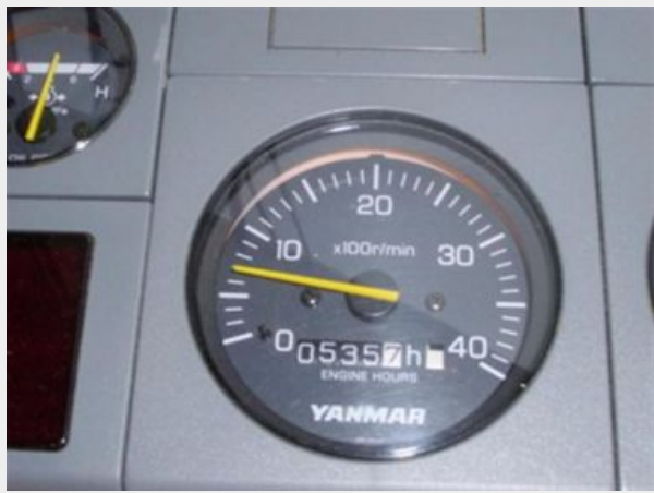
Port Engine Hours