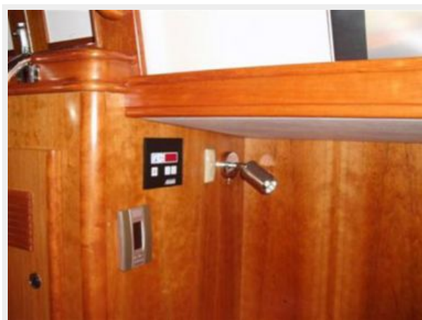
Master Stateroom AC control