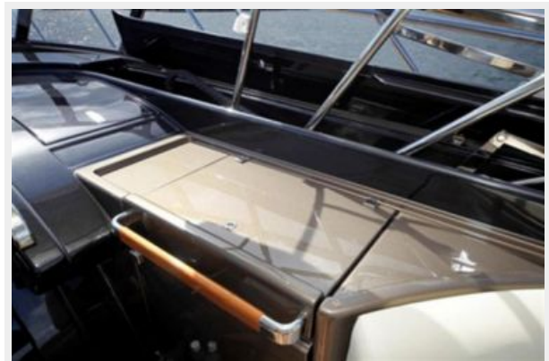
CP Elect BBQ