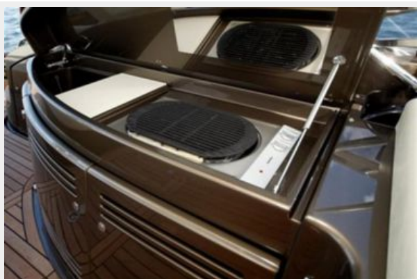
CP Elec BBQ