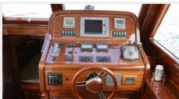
From Vicem brochure - helm