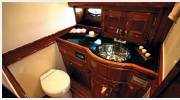
From Vicem brochure - head