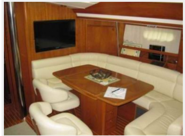
Main salon with flat screen tv