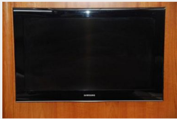
Large flat screen tv