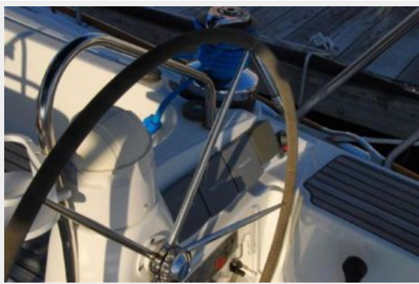
Electric primary on starboard