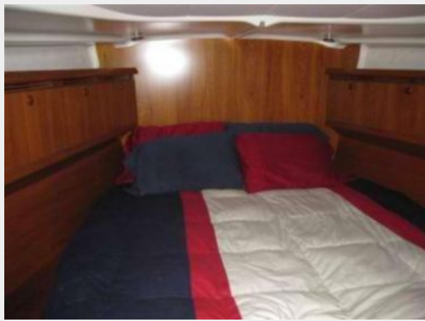
Master Forward Stateroom