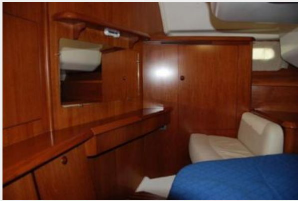
Seating in AFT stateroom