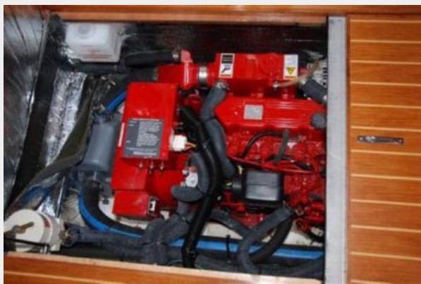
GENSET with sound proofing