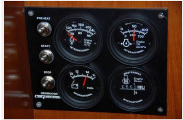
Less than 30 hours on GENSET