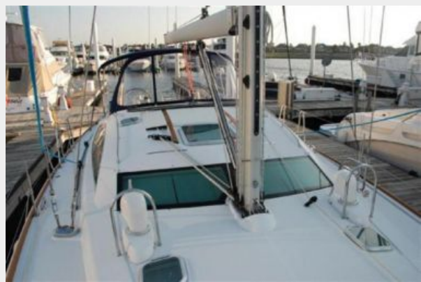
Deck and Dodger