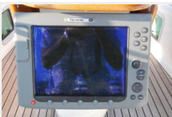
E120 at helm and also at nav station