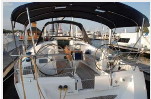
Aft Cockpit with Bimini