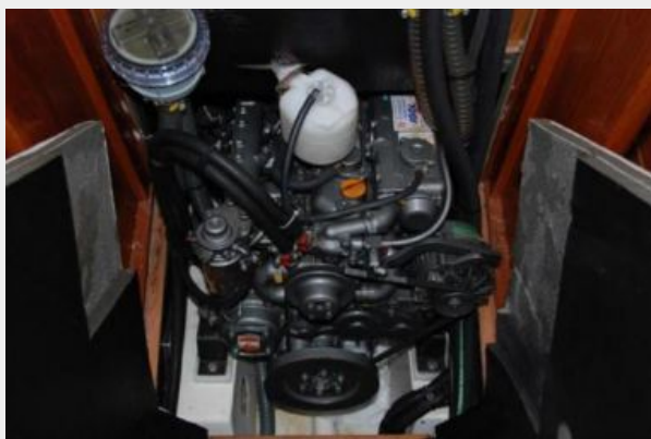
LESS than 200 hours on engine