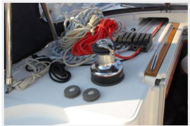
Starboard electric secondary