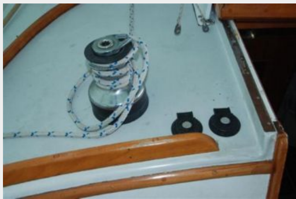
Electric Mainsail Halyard Winch