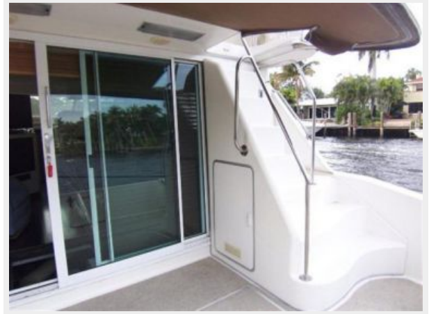
Stairwell to Flybridge