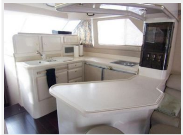
Galley / Breakfast Bar