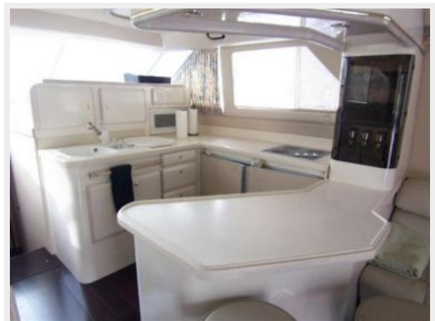
Galley / Breakfast Bar