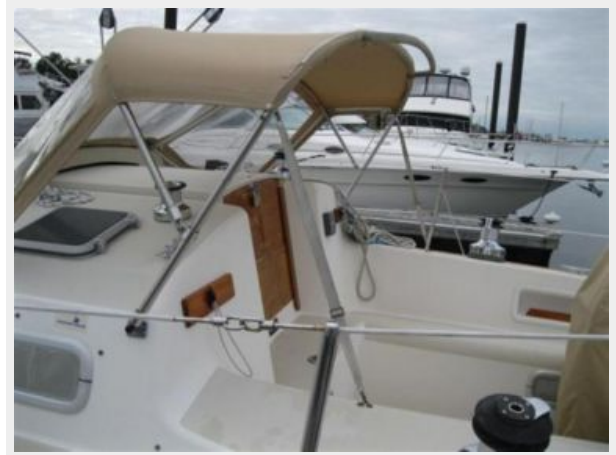
Rugged stainless dodger frame