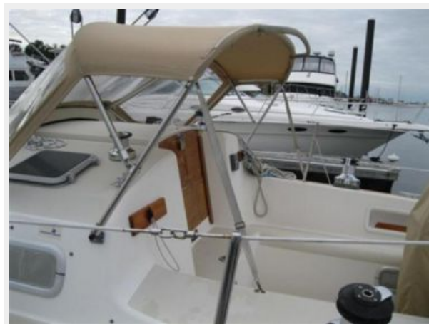
Rugged stainless dodger frame