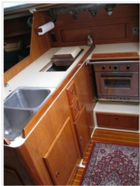
Galley with double sinks