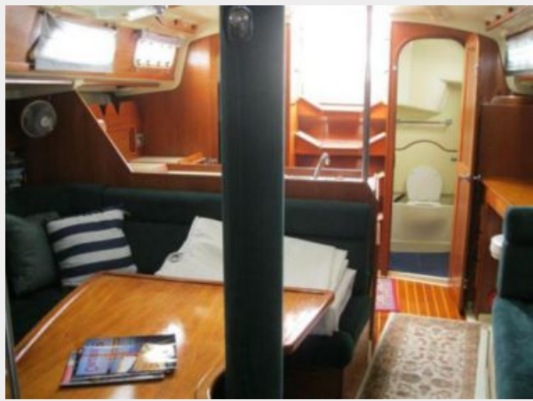
View looking aft in main saloon