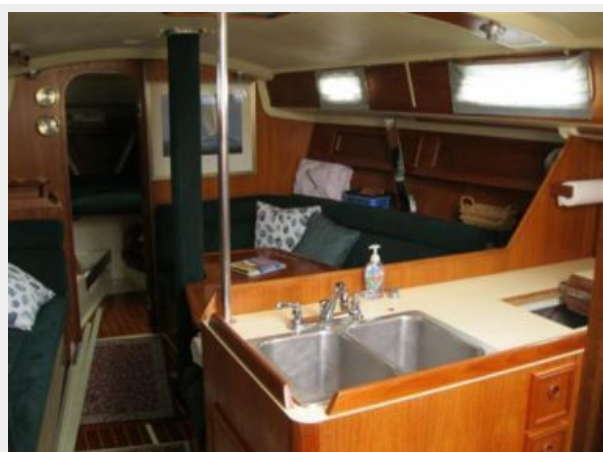
View forward in main salon