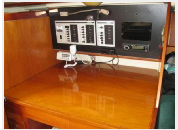
Nav station facing outboard