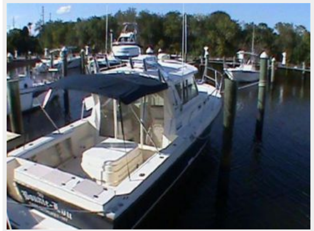
Starboard rear quarter