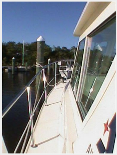
View Fwd port side