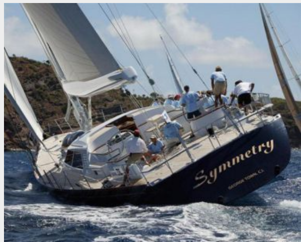
Antigua Sailing Week '05