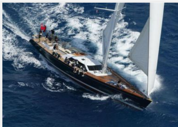
St. Barths Bucket '07