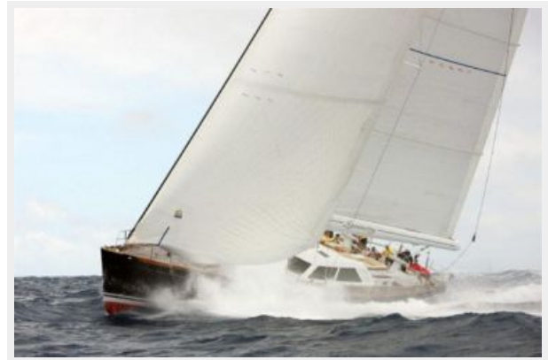
St. Barths Bucket '12