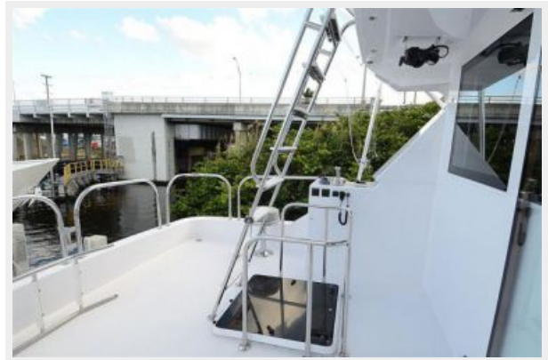
Pilothouse Aft Deck