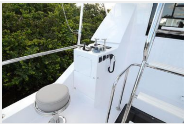
Pilothouse Aft Deck Control Station