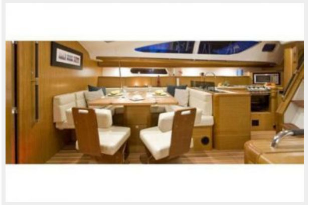
Manufacturer Provided Image: Saloon