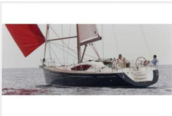
Under Spinnaker