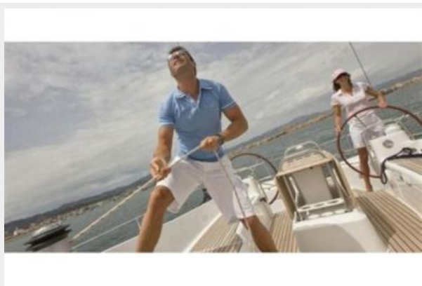
Manufacturer Provided Image: Cockpit