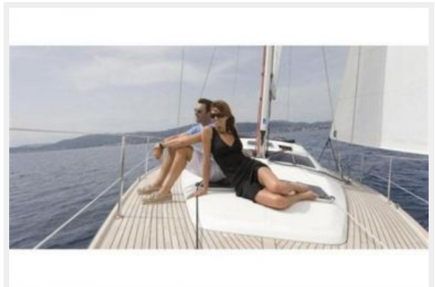
Manufacturer Provided Image: Bow