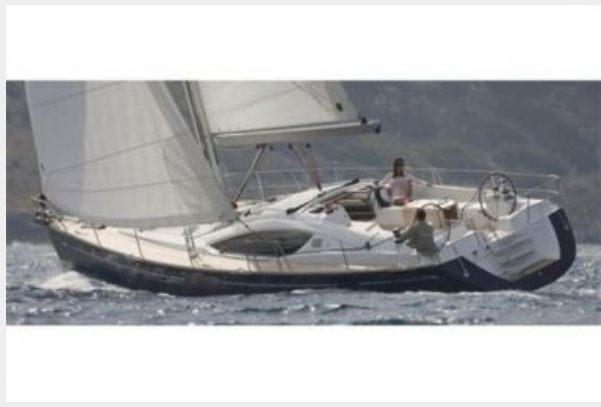
Port Side View