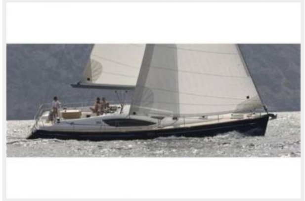
Starboard Side View