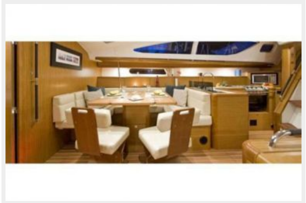
Manufacturer Provided Image: Saloon