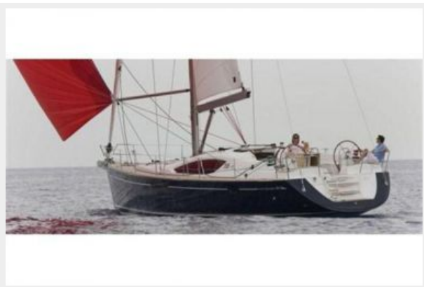
Manufacturer Provided Image: Under Spinnaker