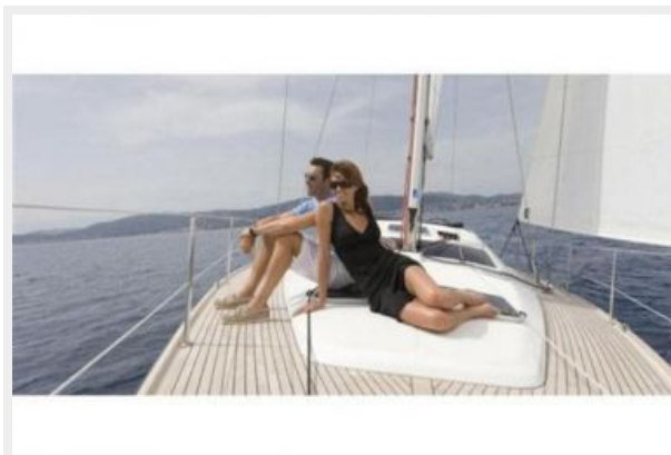
Manufacturer Provided Image: Bow