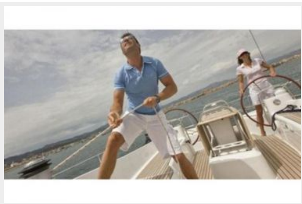
Manufacturer Provided Image: Cockpit