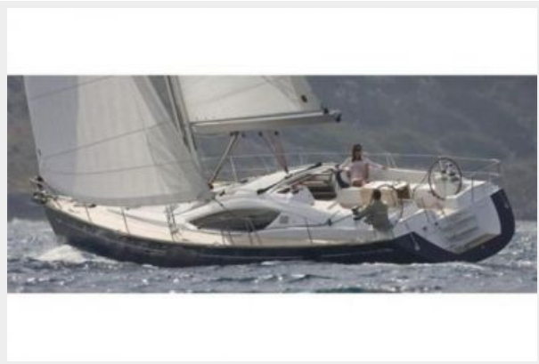
Port Side View