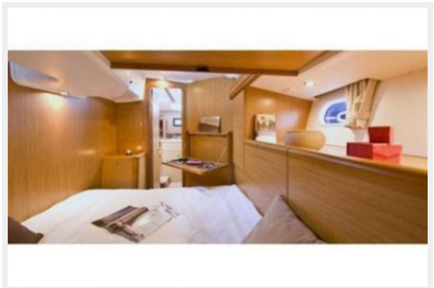
Manufacturer Provided Image: Aft Cabin