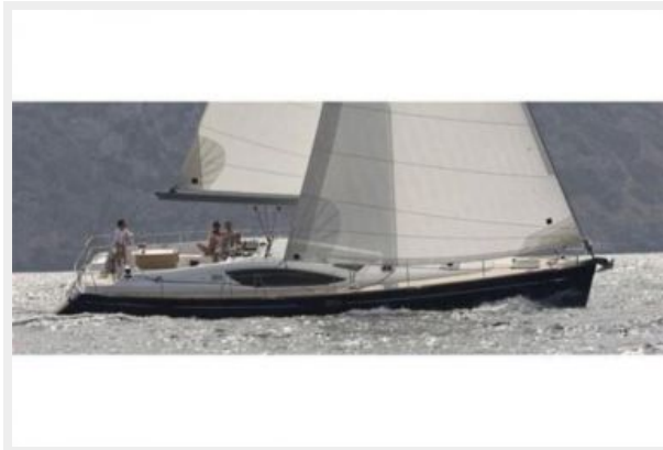
Starboard Side View