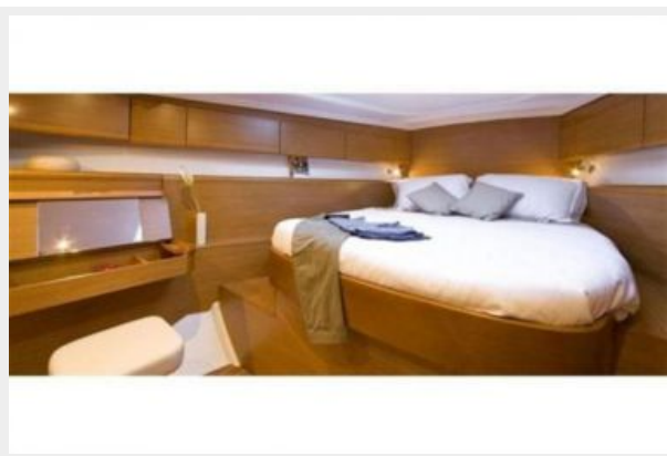
Manufacturer Provided Image: Forward Cabin