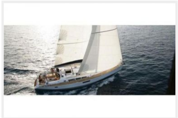
Manufacturer Provided Image: Under Sail