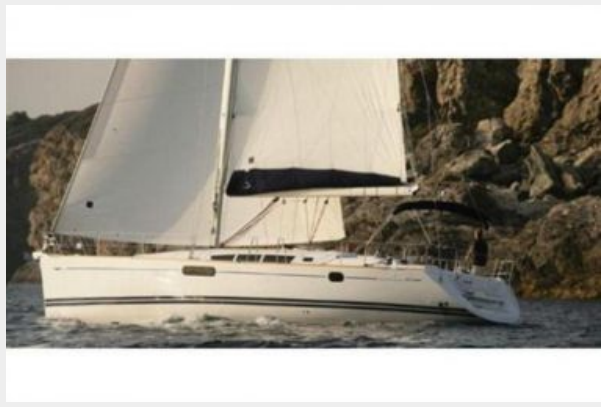
Port Side View