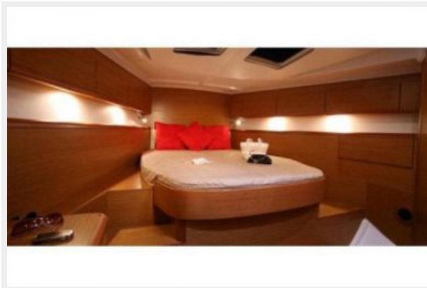
Forward Cabin