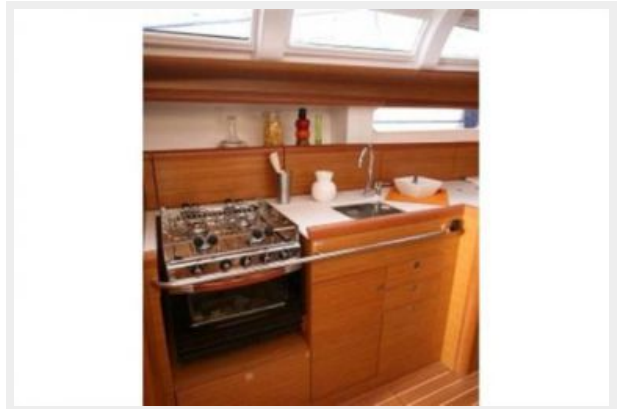
Galley