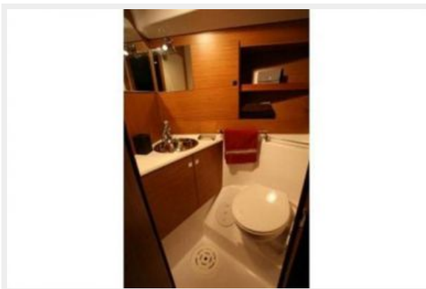
Manufacturer Provided Image: Head