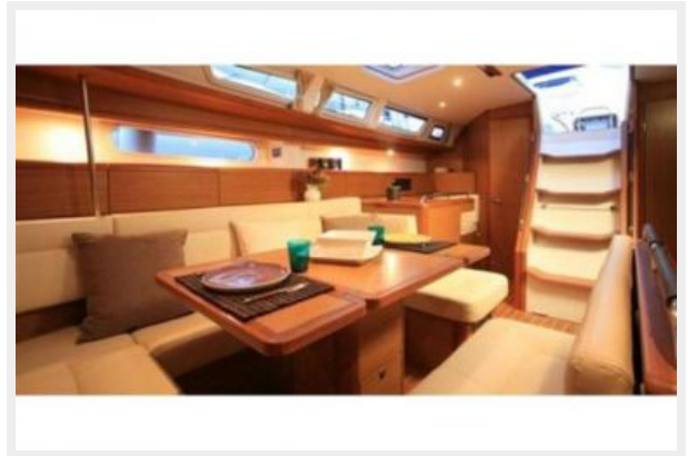
Dining Area