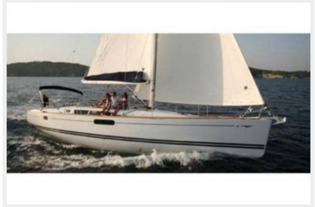
Manufacturer Provided Image: Starboard Side View