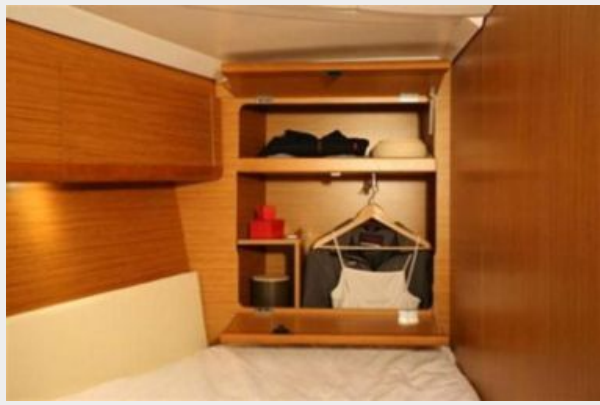
Manufacturer Provided Image: Cabin Storage