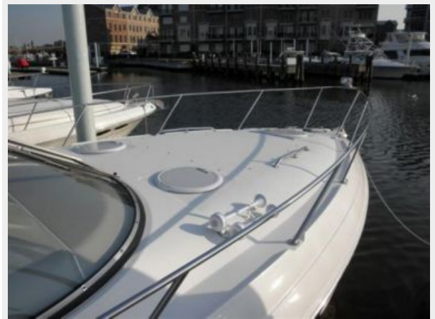
Bow With windlass