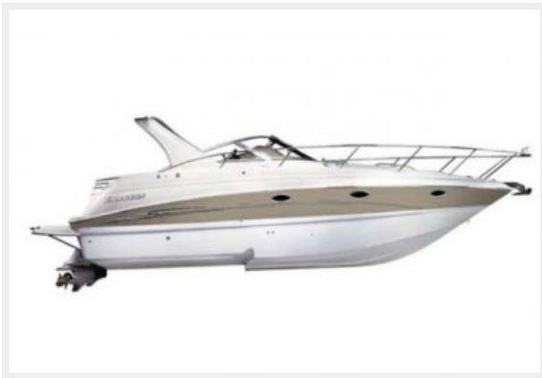
Manufacturer Provided Drawing