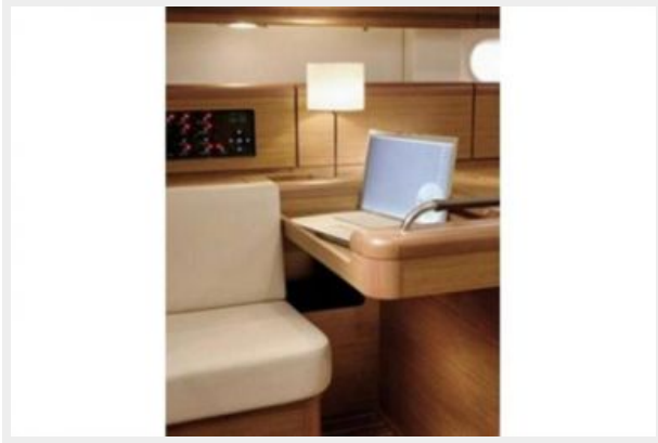
Manufacturer Provided Image: Nav Table