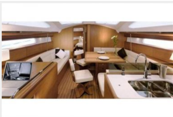
Manufacturer Provided Image: Saloon