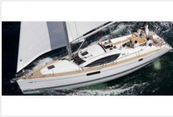
Manufacturer Provided Image: View from Above