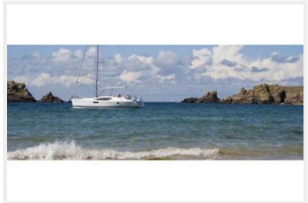
Manufacturer Provided Image: At Anchor