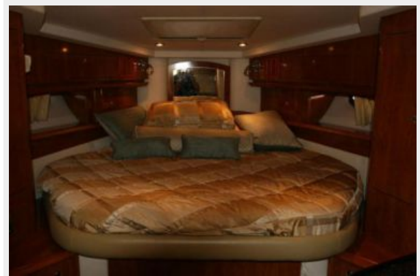
Master queen berth