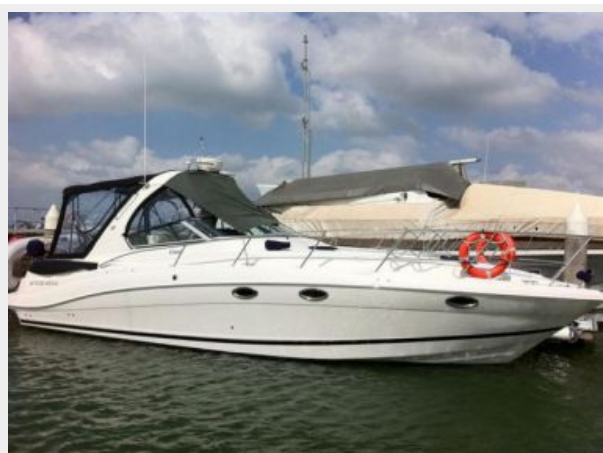
Ready to go