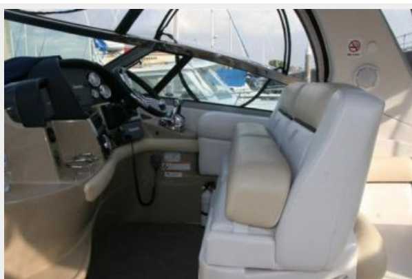
Helm seating with bolsters up