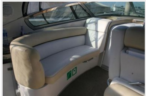
Forward port seating