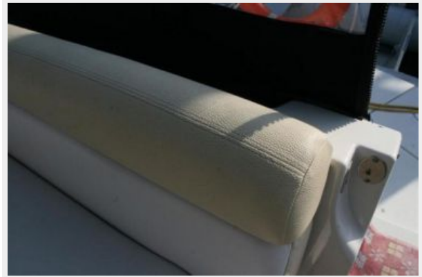
Cockpit upholstery looks brand new!