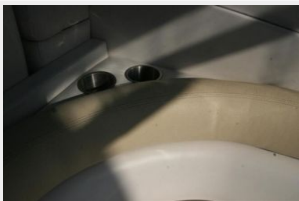
Convenient details like cupholders everywhere