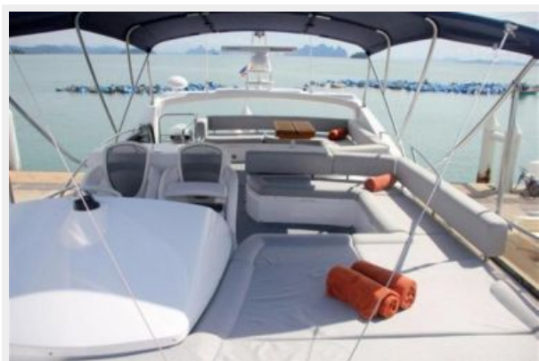
Flybridge Looking Aft