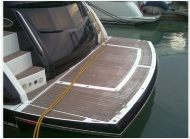
Hydraulic Swim Platform with Double Shorepower Cord