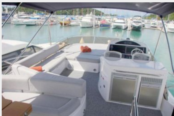
Flybridge Looking Forward