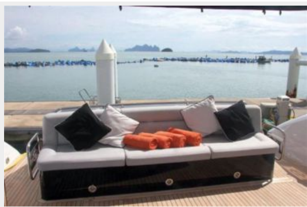
Aft Deck Settee