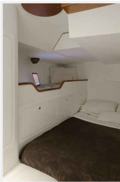
Stern Cabin Starboard