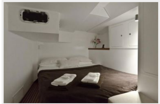
Stern Cabin Port