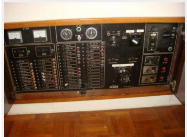
41' Symbol electrical panel