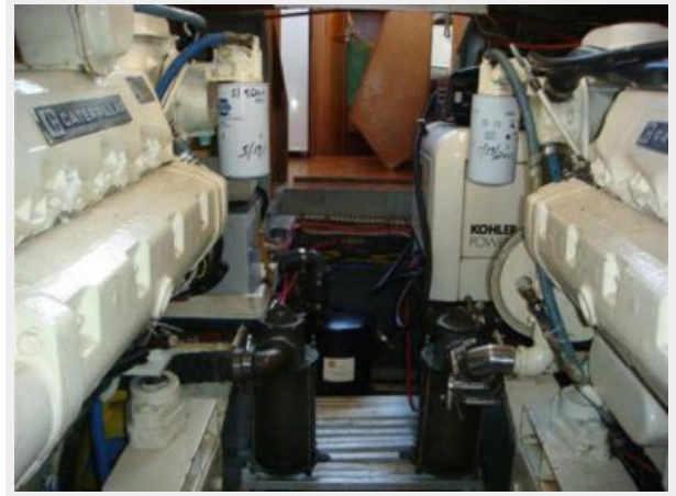
41' Symbol engine room forward