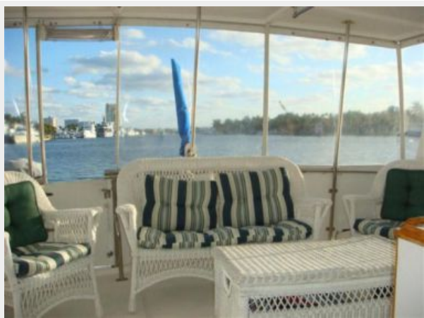
41' Symbol sundeck photo2