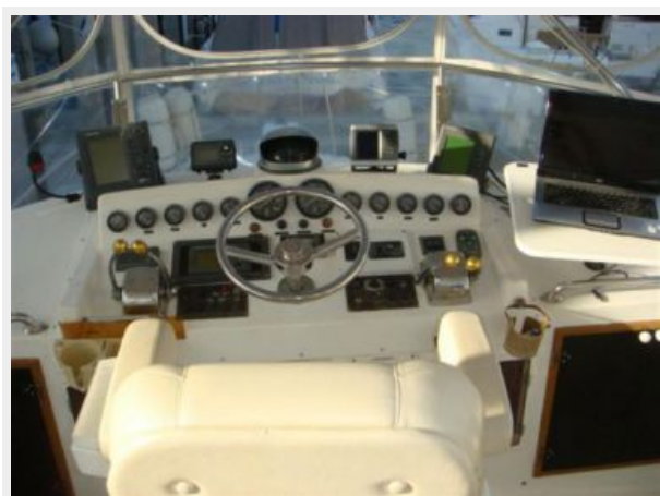
41' Symbol flybridge console