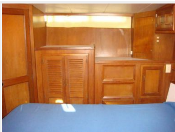
41' Symbol master stateroom starboard