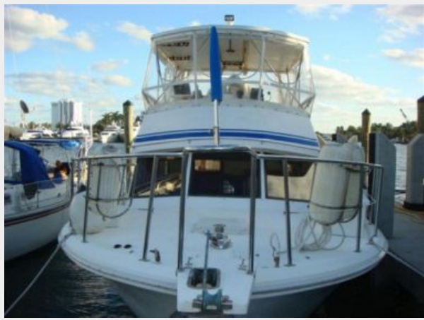
41' Symbol forward profile