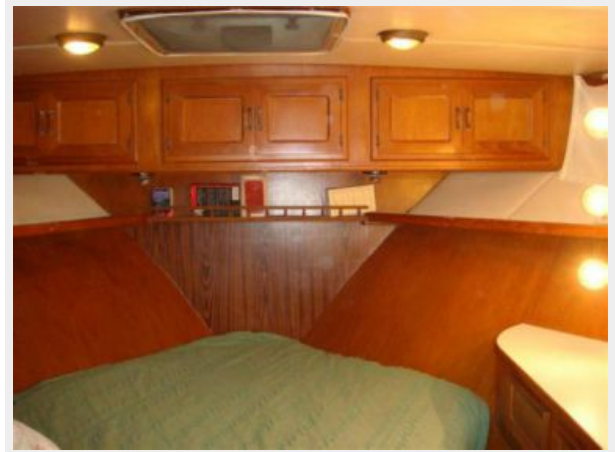
41' Symbol guest stateroom