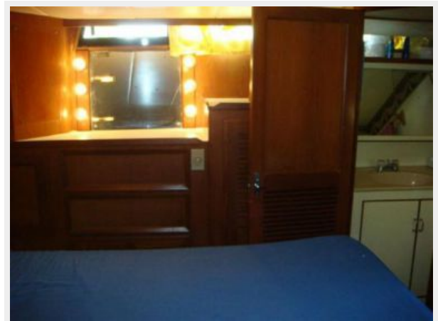
41' Symbol master stateroom port