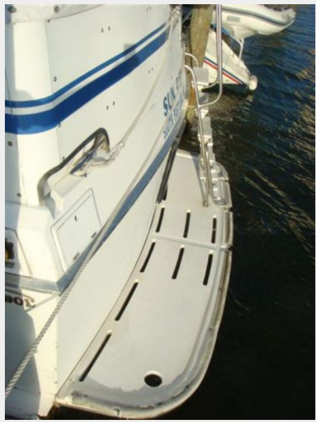
41' Symbol swimplatform