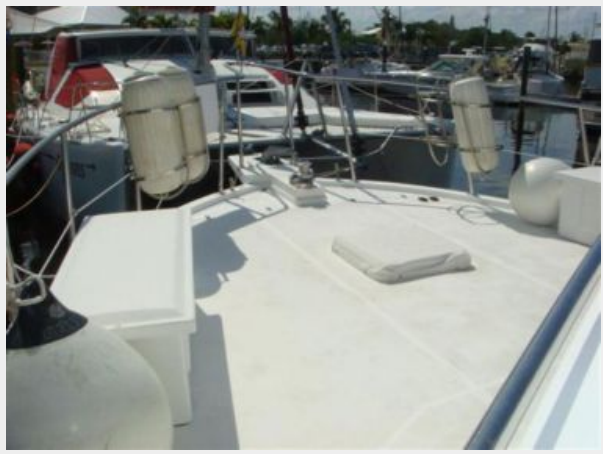
41' Symbol foredeck