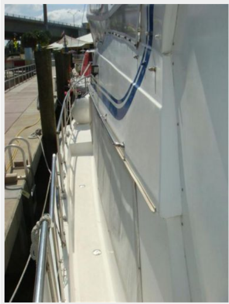
41' Symbol port side deck