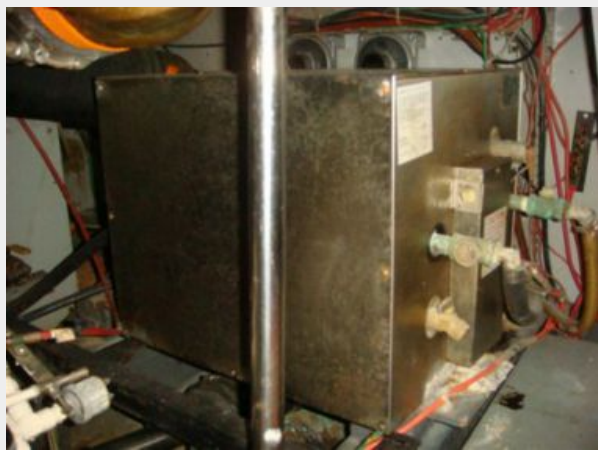
41' Symbol water heater