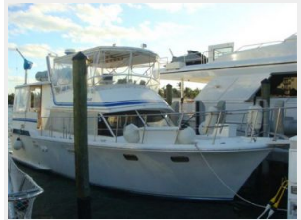
41' Symbol starboard forward profile