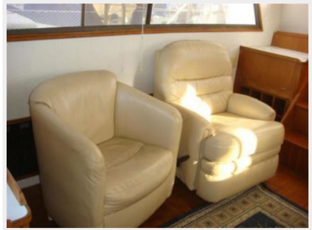
41' Symbol salon starboard lounge chairs