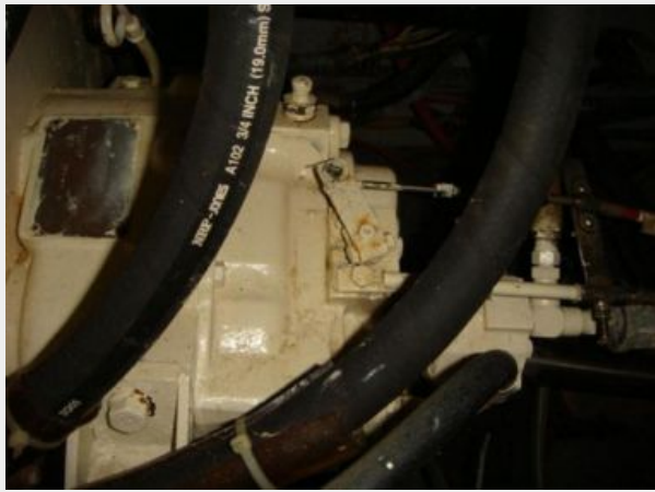
41' Symbol starboard gearbox