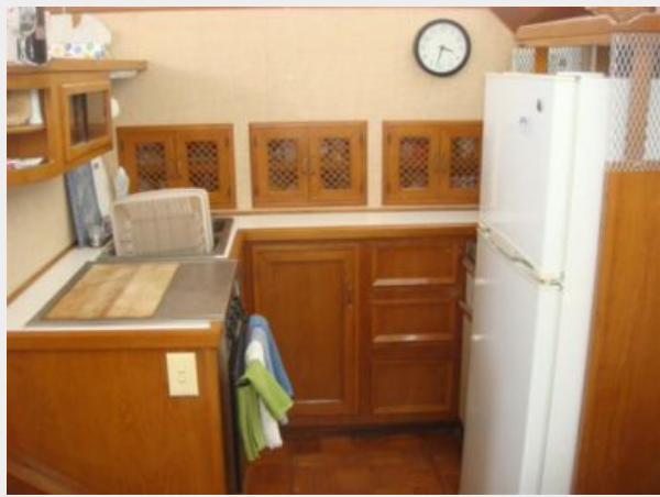
41' Symbol galley photo2