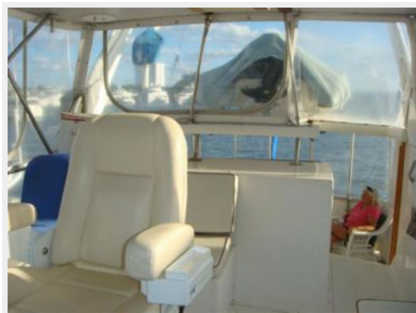
41' Symbol flybridge aft