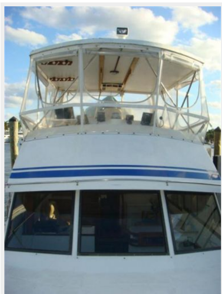
41' Symbol foredeck aft