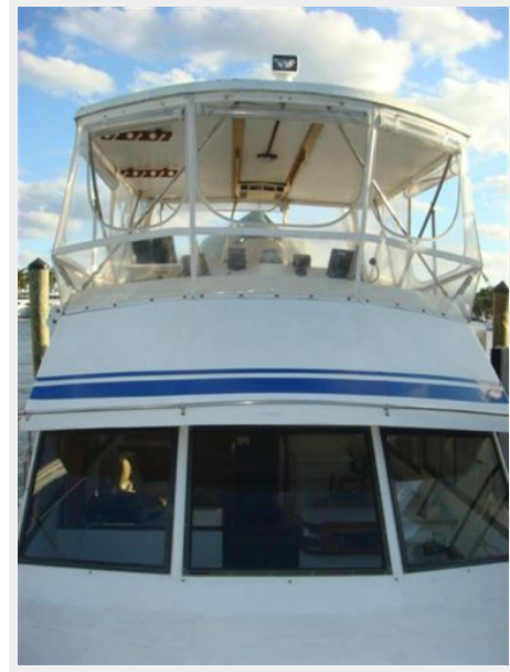
41' Symbol foredeck aft