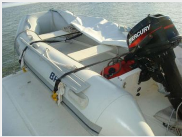
41' Symbol tender