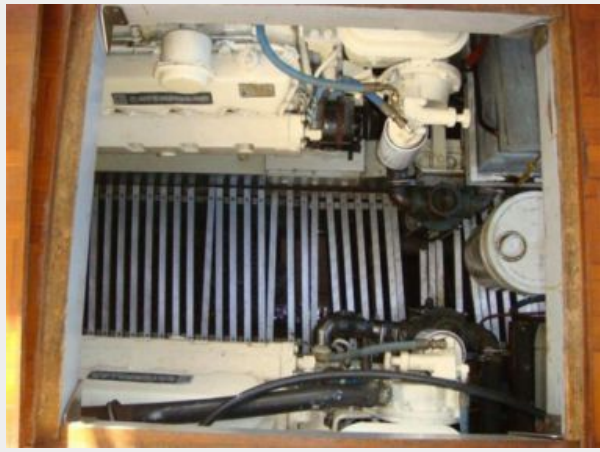
41' Symbol engine room access