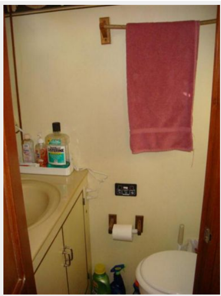
41' Symbol guest stateroom head