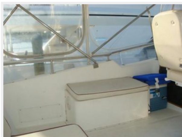
41' Symbol flybridge port