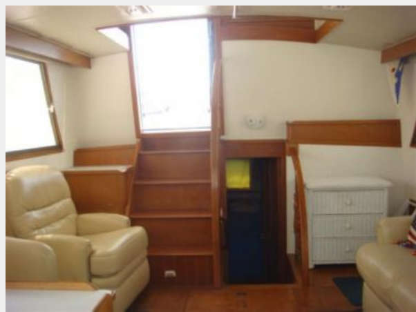
41' Symbol salon aft