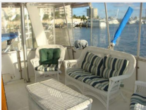
41' Symbol sundeck starboard