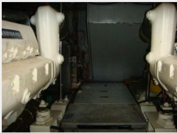
41' Symbol engine room aft