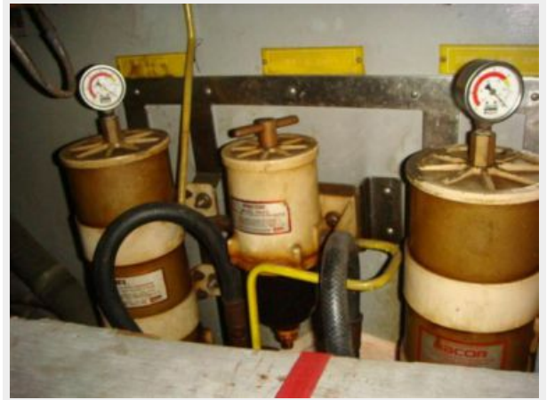
41' Symbol Racor fuel filters