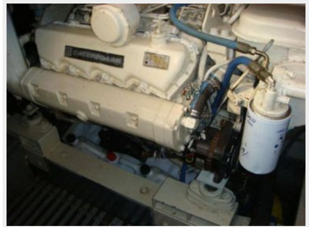
41' Symbol port main engine