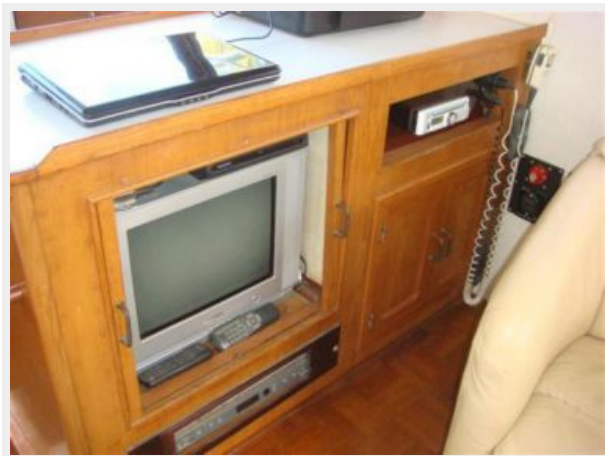
41' Symbol salon starboard forward entertainment cabinet