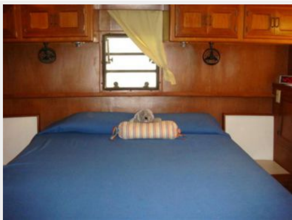
41' Symbol master stateroom