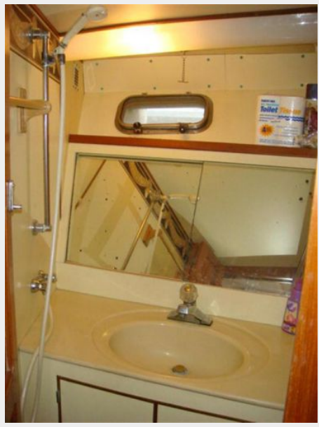
41' Symbol master stateroom shower