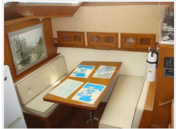
41' Symbol dinette