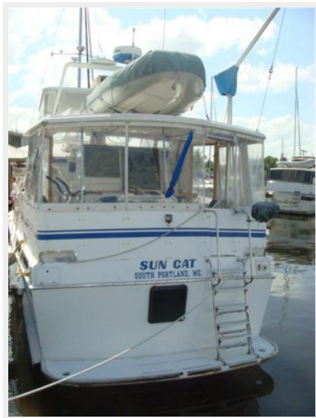
41' Symbol aft profile