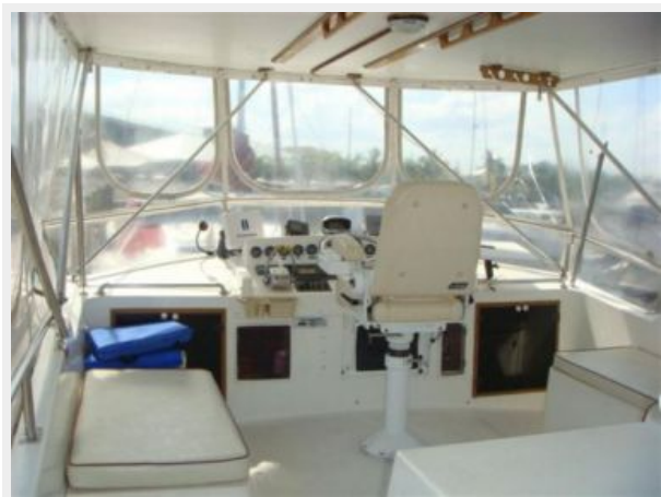
41' Symbol flybridge forward