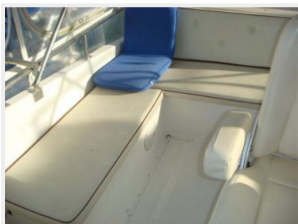
41' Symbol flybridge starboard seating photo1