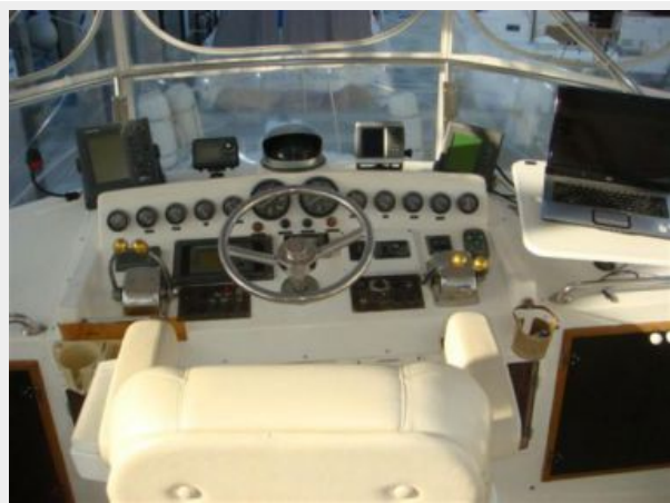
41' Symbol flybridge console