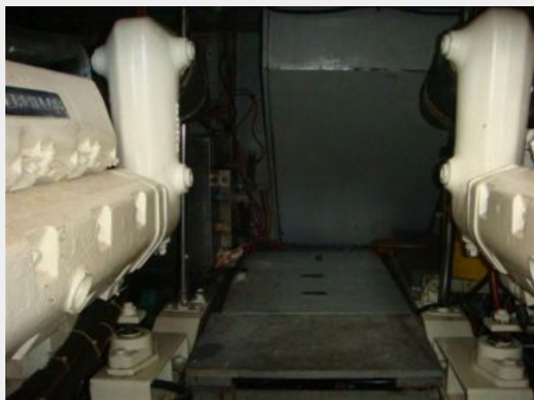
41' Symbol engine room aft