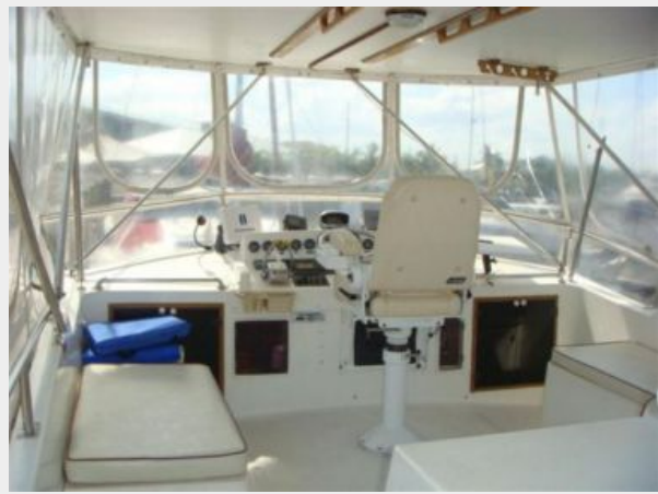
41' Symbol flybridge forward