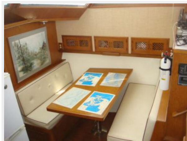
41' Symbol dinette