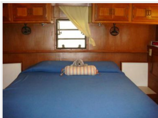
41' Symbol master stateroom