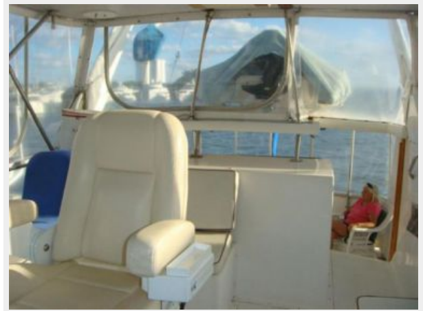
41' Symbol flybridge aft