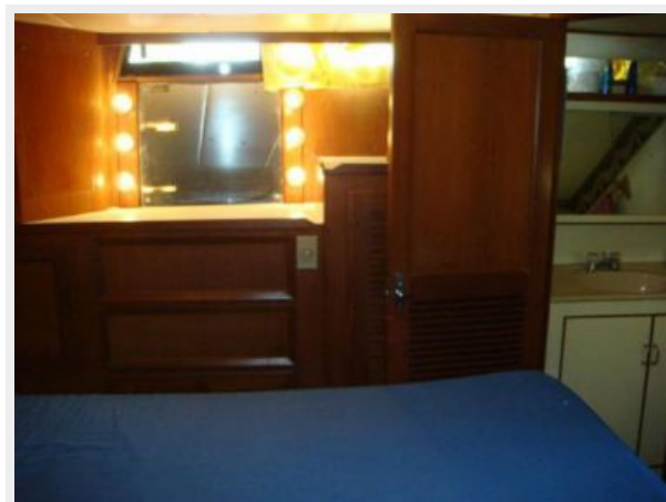
41' Symbol master stateroom head