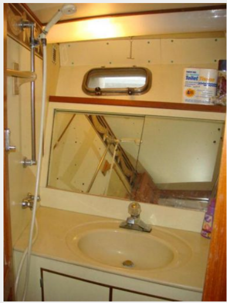
41' Symbol master stateroom shower