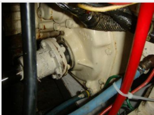
41' Symbol port gearbox