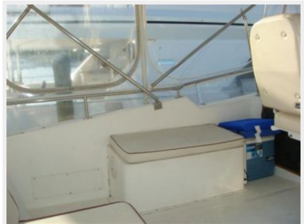
41' Symbol flybridge port