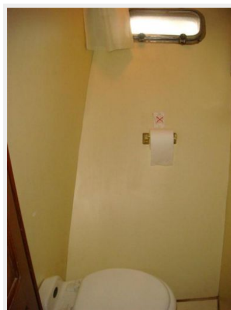
41' Symbol master stateroom head