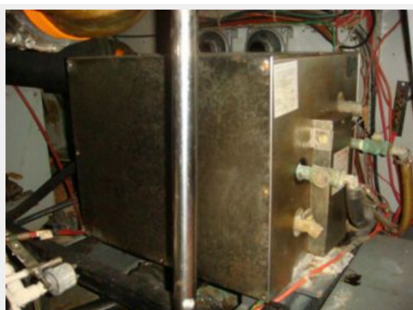
41' Symbol water heater