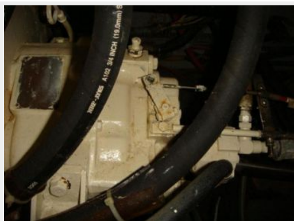
41' Symbol starboard gearbox