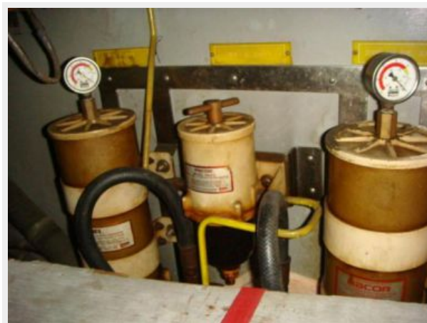
41' Symbol Racor fuel filters