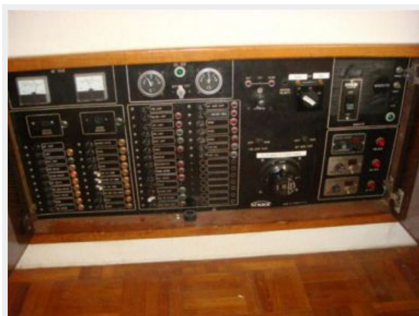
41' Symbol electrical panel