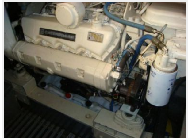
41' Symbol port main engine