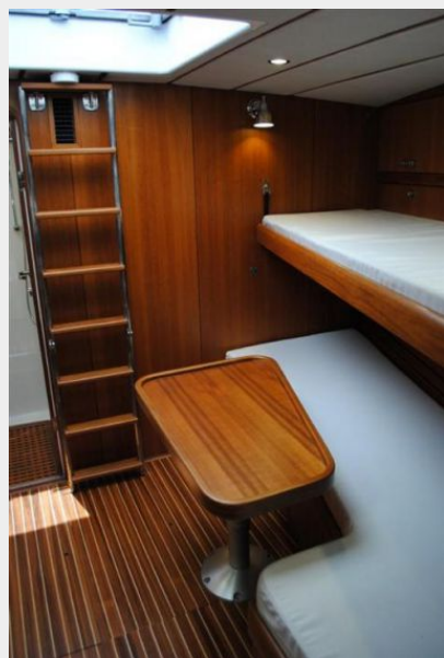
Crew Accommodation Looking Aft