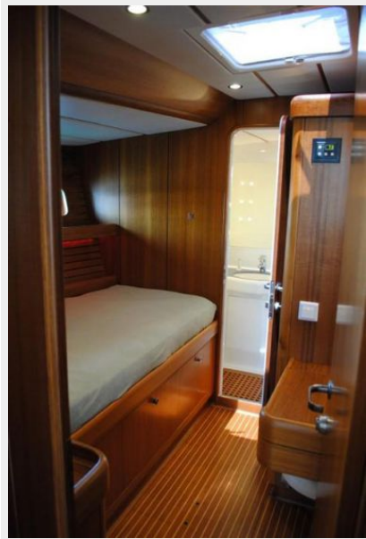
Port Guest Cabin