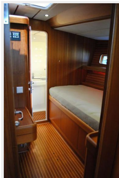
Starboard Guest Cabin