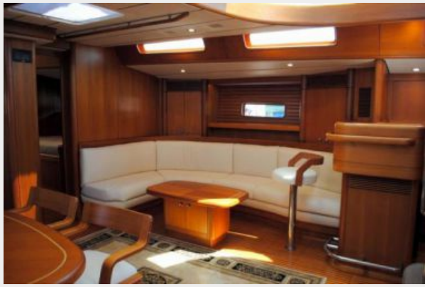
Salon to Starboard