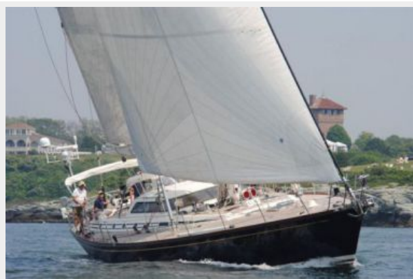
Sailing Profile 2