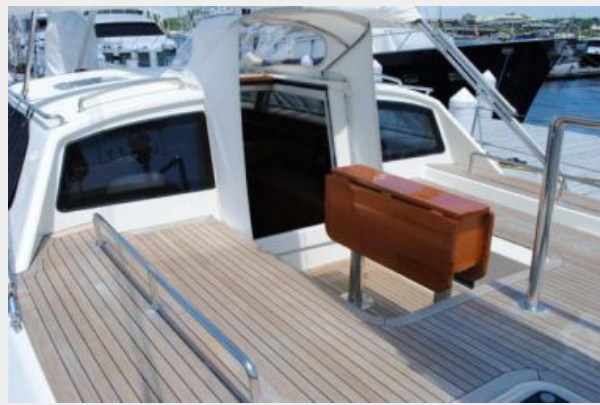
Center Cockpit Seating