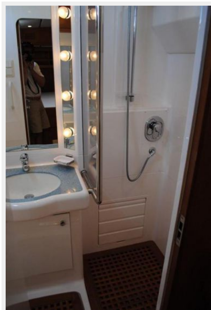
Master Head 2