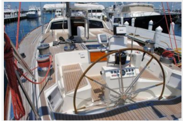
Aft Cockpit Looking Forward