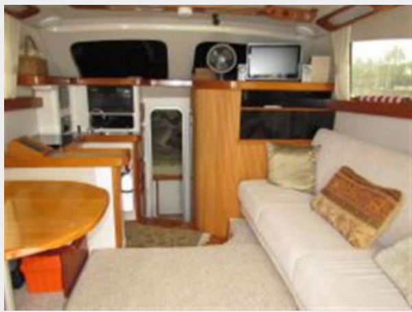
INTERIOR VIEW W/CONV SOFA- STARBOARD & DINETTE- PORT