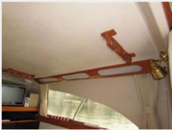
MAIN SALON OVERHEAD- STARBOARD