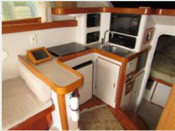
GALLEY FROM SALON