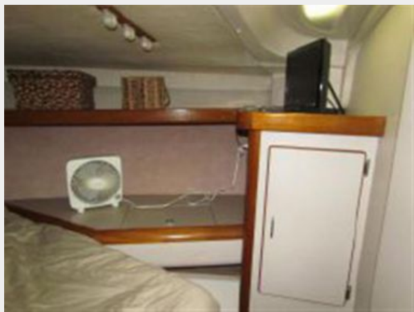
FORWARD CABIN STARBOARD VIEW