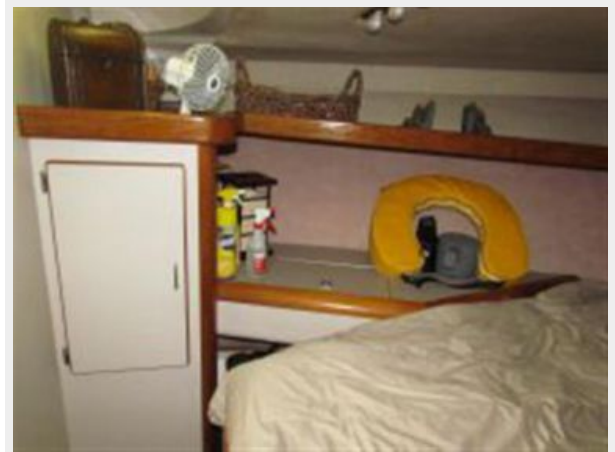
FORWARD CABIN PORT VIEW