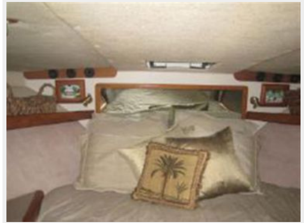
CENTERLINE BERTH FORWARD