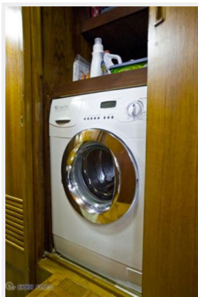
Washer/Dryer with designated water heater