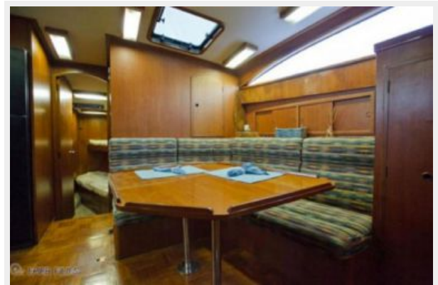
Dinette with Storage Below