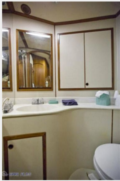
Captain's Quarters Ensuite Head w/Vacu-flush Head & Wet Shower