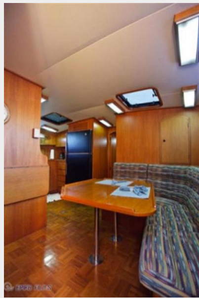
Dinette Area looking forward