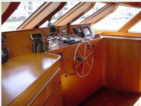
Pilothouse to Starboard