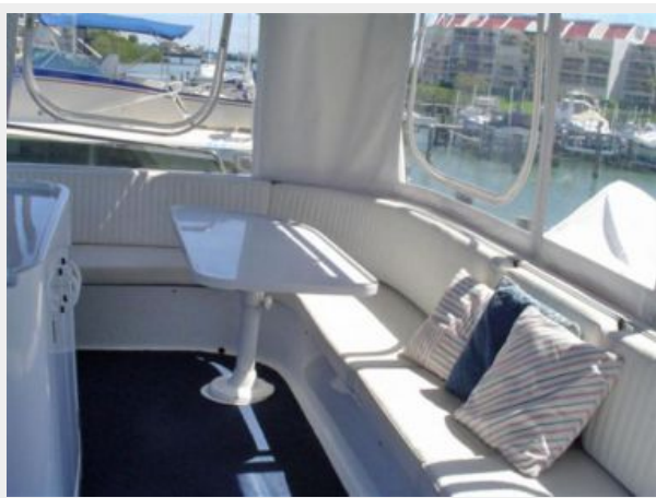
Bridge Deck Starboard