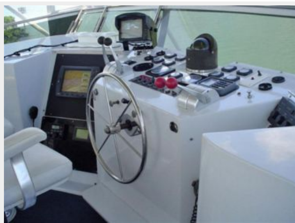
Bridge Deck Helm Station