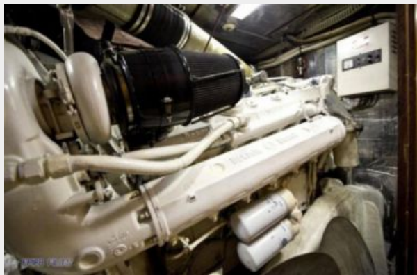
Detroit Diesels (900 HP Each)