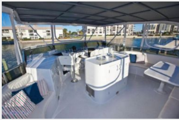
Bridge Deck looking forward with Wet Bar & Refrigerator