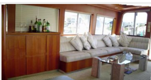
Main Salon & Wet Bar