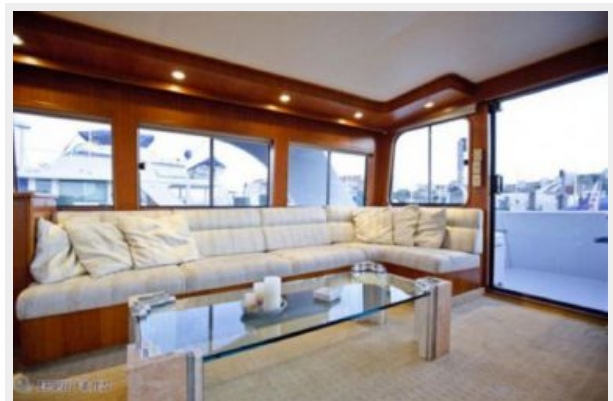
Main Salon Starboard