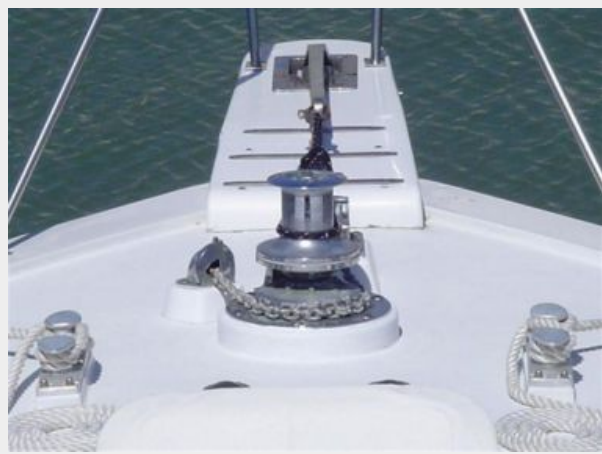
Windlass w/250Ft chain