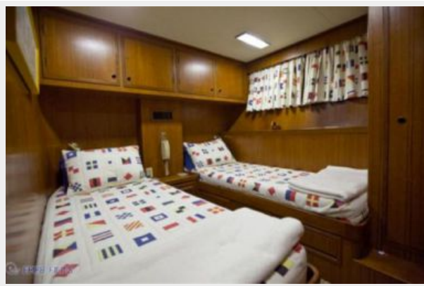
Portside Guest Stateroom