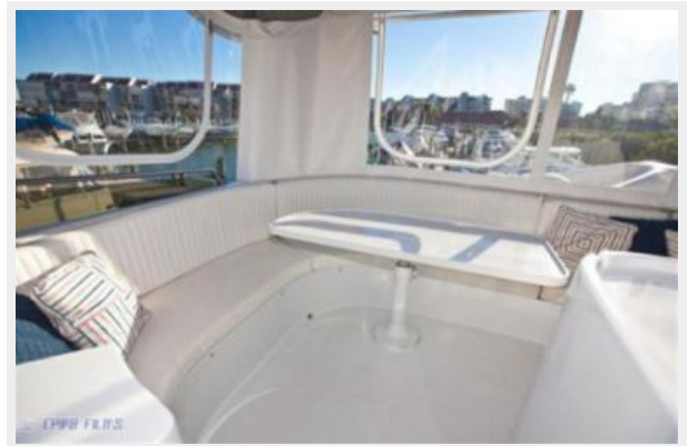
Bridge Deck Portside