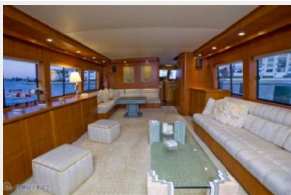
Main Salon from Cockpit