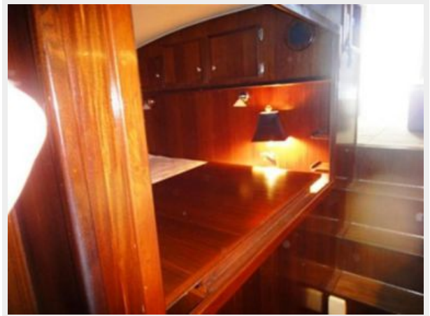
Custom Fold-Down Partition