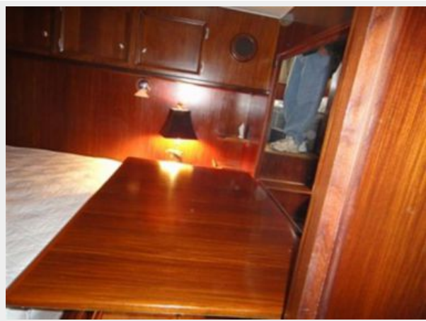
Custom Fold-Down as Table