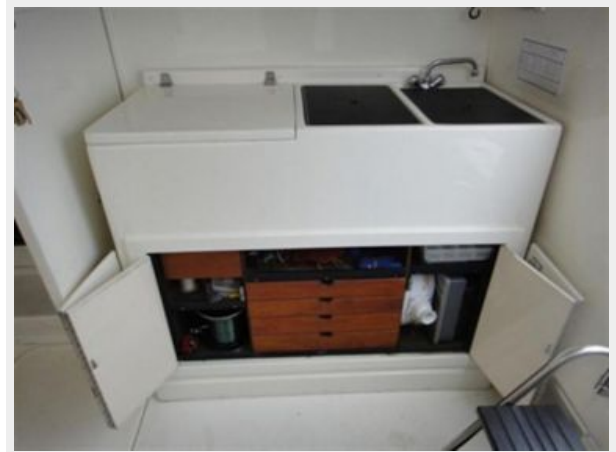
Cockpit Sink & Tackle